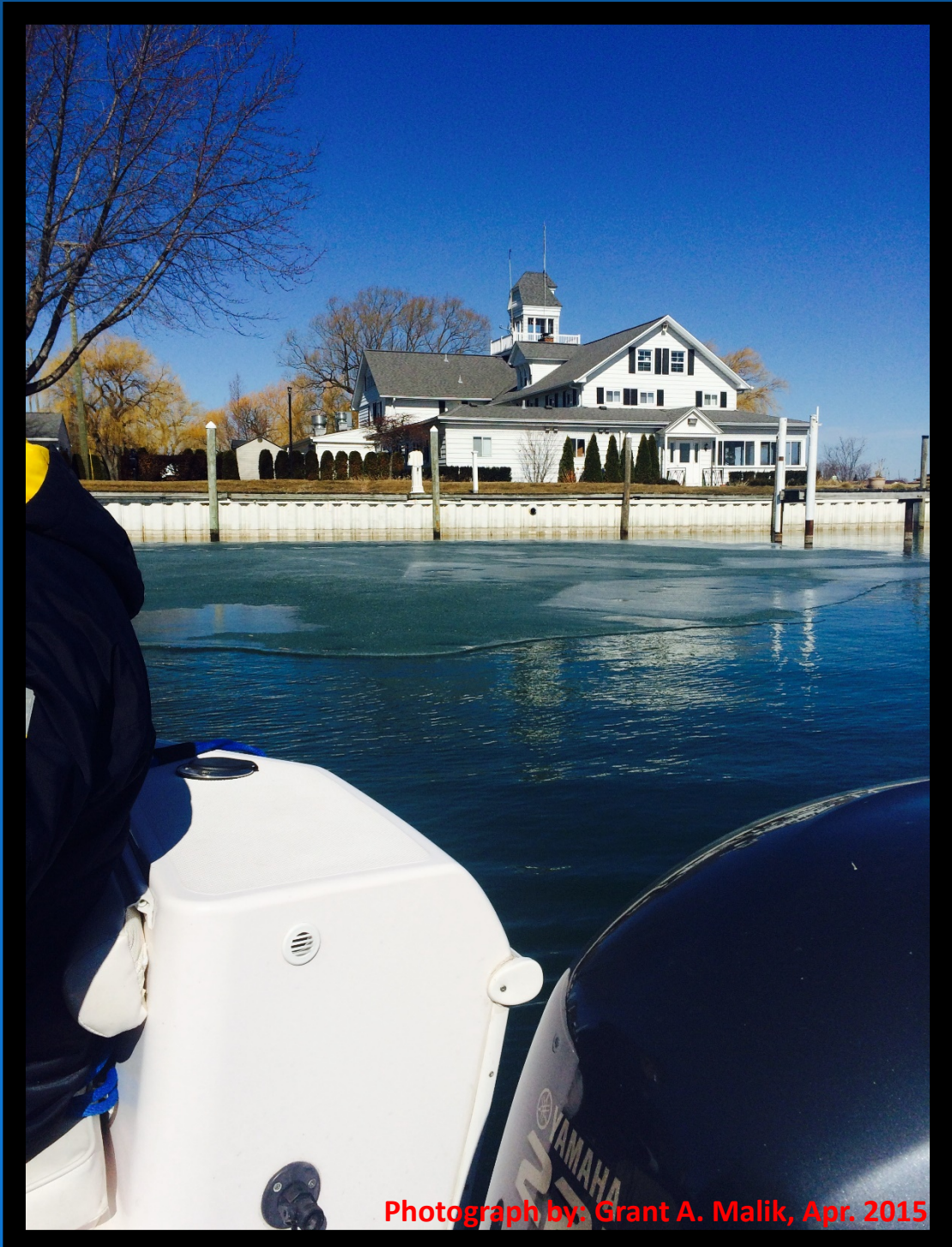
Photograph by: Grant A. Malik, Apr. 2015