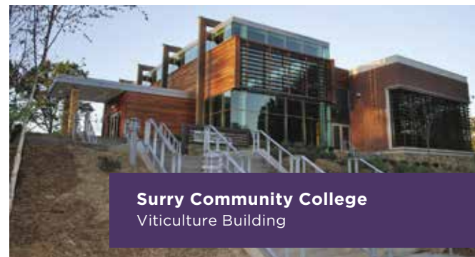
Surry Community College Viticulture Building

Surry Community College's Viticulture and Enology curriculum is the only program of its kind in the Southeast with an on-site teaching vineyard and state-of-the-art, bonded winery. Additionally, SCC is the only wine making program on the Eastern side of the United States that teaches the production of sparkling wine. The college offers an associate degree in Viticulture and Enology along with three certificates in Viticulture, Enology and Wine Marketing.