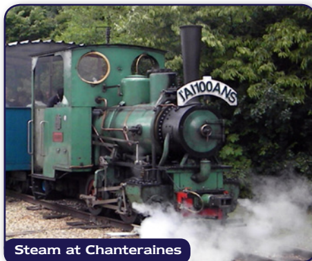
Steam at Chanteraines

A wonderful tour based around the superb Baie de Somme Steam Festival celebrations. Which will delight enthusiasts and partners alike, who appreciate the novelty of the railways and the gentle pace of the tour allowing ample opportunity to 'opt out' of the programme to spend free-time enjoying the café culture, local drink and cuisine in the idyllic seaside resort of St Valéry or a full day in Paris. In the evenings take time to visit Amiens' beautiful cathedral and local drink and cuisine in restaurants idyllically set on the banks of the Somme.