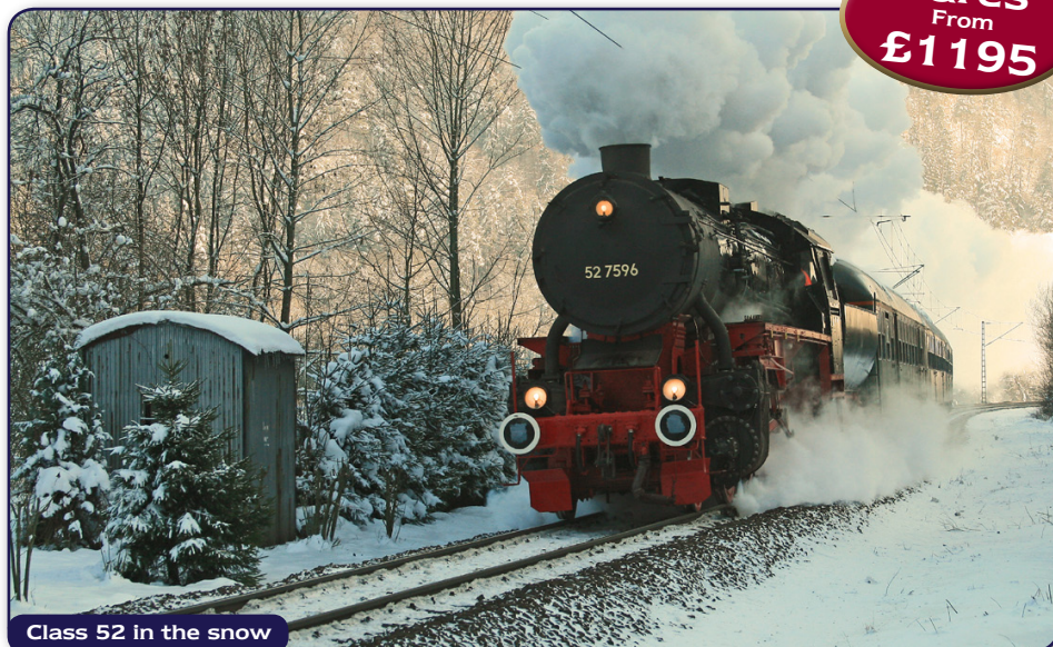
Class 52 in the snow