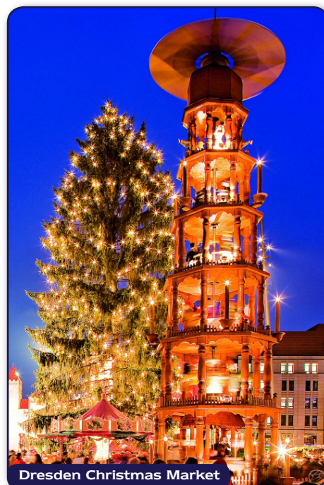
Dresden Christmas Market