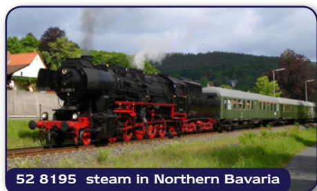
52 8195 steam in Northern Bavaria