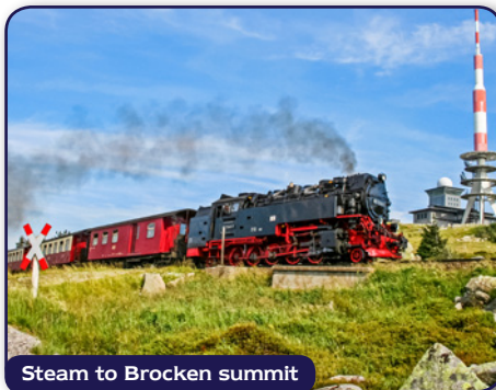
Steam to Brocken summit