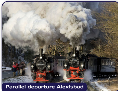
Parallel departure Alexisbad