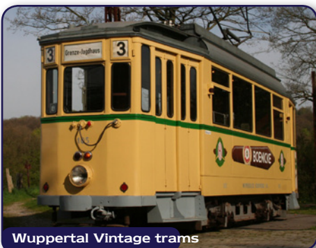
Wuppertal Vintage trams

German Summer Steam Explorer (10 days in total – see overleaf)