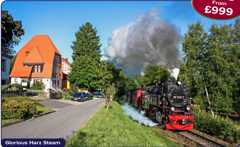
Glorious Harz Steam