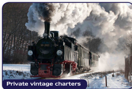
Private vintage charters

Based in the stunning and historic town of the witches – Wernigerode this is an immensely popular tour and early booking is highly recommended – particularly as we are offering no single supplement for those requiring single occupancy of a room for a limited period only.