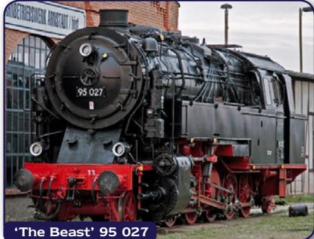
'The Beast' 95 027