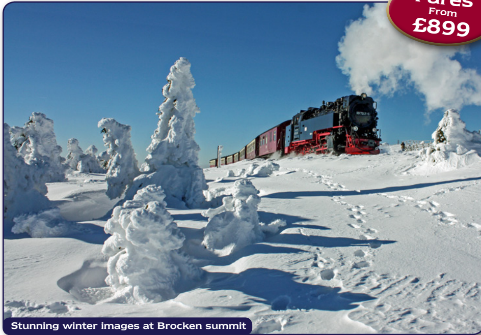
Stunning winter images at Brocken summit