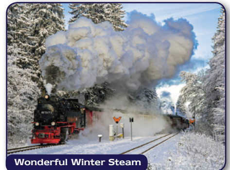
Wonderful Winter Steam