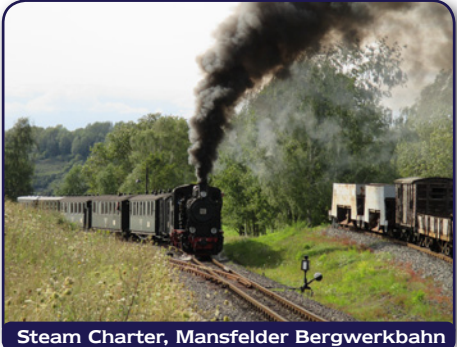
Steam Charter, Mansfelder Bergwerkbahn