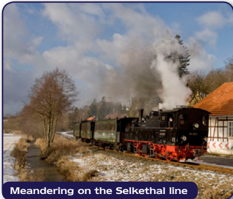
Meandering on the Selkethal line

Harz Winter Steam plus Poland Steam, Snow & World War II (14 days in total – see overleaf)