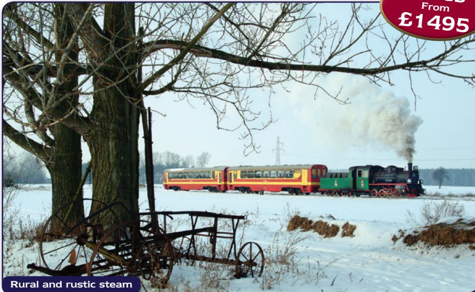
Rural and rustic steam