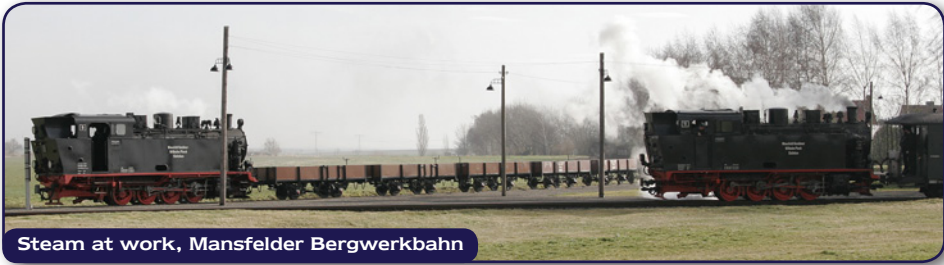
Steam at work, Mansfelder Bergwerkbahn