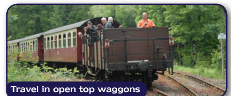
Travel in open top waggons