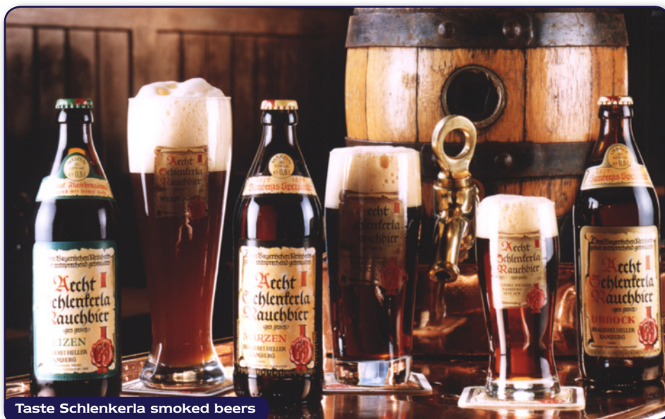
Taste Schlenkerla smoked beers