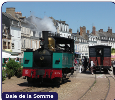
Baie de la Somme