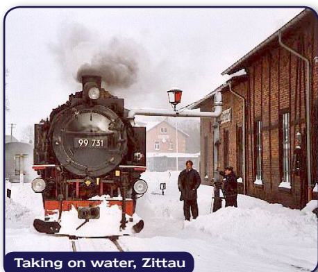
Taking on water, Zittau

This tour will delight the enthusiast of steam trains with its featured locos and variety of lines, and is a must for partners who enjoy the nostalgia of steam and the opportunity to visit some of the finest rural scenery and towns in Saxony and beyond – crowned with traditional carved wood decorations and Christmas stalls that feature locally-made, hand-crafted, quality products. A totally unique and magical festive tour.