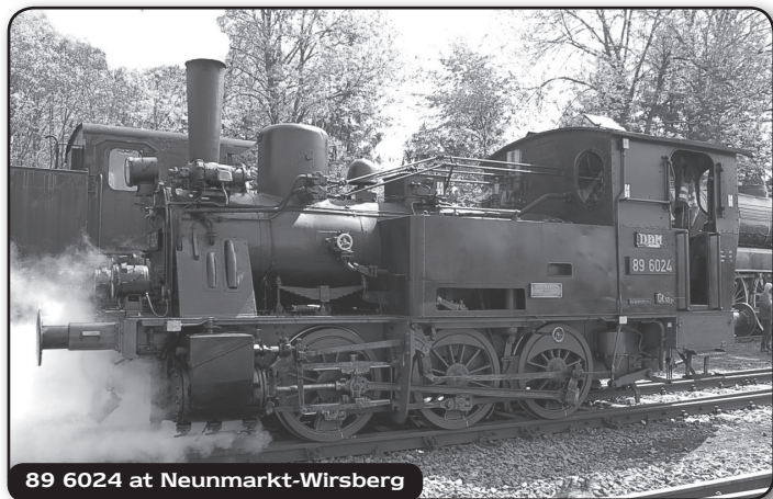
89 6024 at Neuenmarkt-Wirsberg

(B) = Breakfast included, (D) = Dinner included, (L) = Lunch included