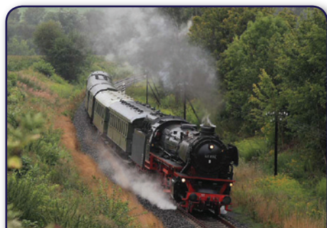
Class 41 steaming through the landscape