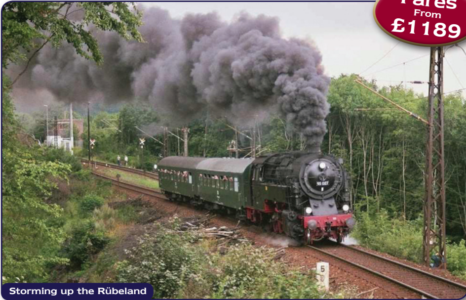
Storming up the Rübeland