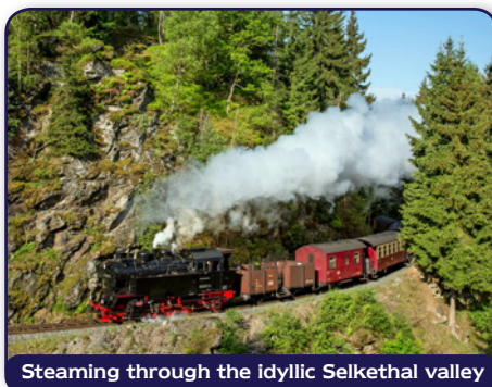
Steaming through the idyllic Selkethal valley