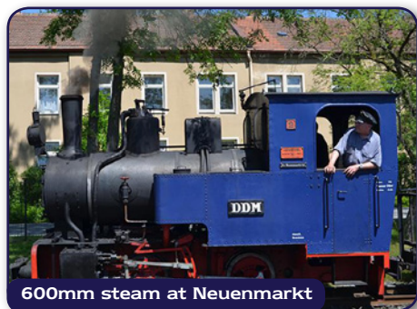
600mm steam at Neuenmarkt