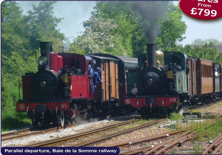
Parallel departure, Baie de la Somme railway