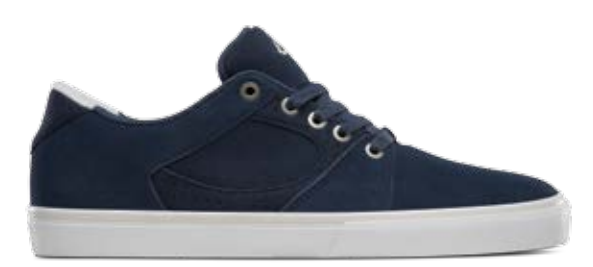
NAVY 401 | Suede, Synthetic