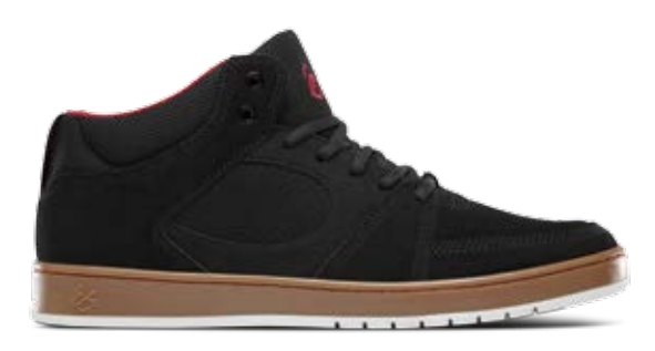
BLACK / GUM 964 | Suede / Synthetic