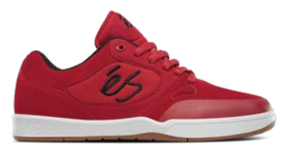
RED 600 | Suede, Textile, Synthetic