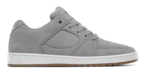
LIGHT GREY 050 | Suede, Textile