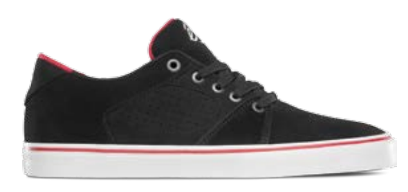
BLACK / WHITE / RED 978 | Suede, Synthetic | C/O