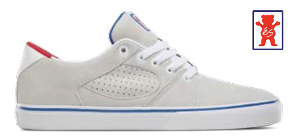
WHITE 100 | Suede, Synthetic