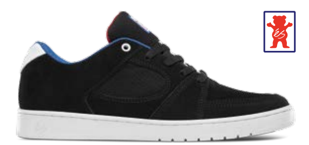
BLACK 001 | Suede, Textile