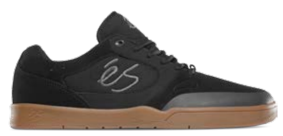
BLACK / GUM 964 | Suede, Textile, Synthetic | C/O