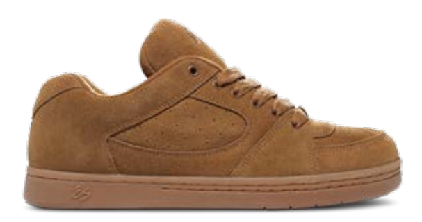
BROWN / GUM 212 | Suede | C/O