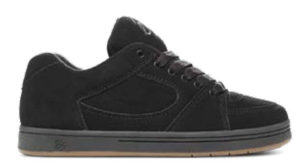
BLACK 001 | Suede | C/O