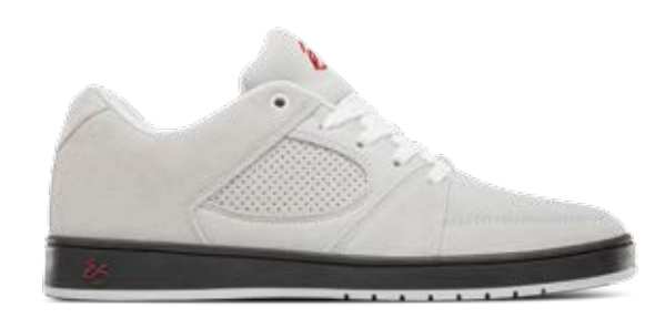
WHITE / BLACK 110 | Suede, Textile