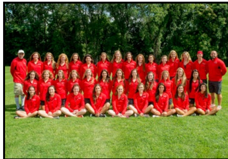
2015 WOMEN'S ROSTER