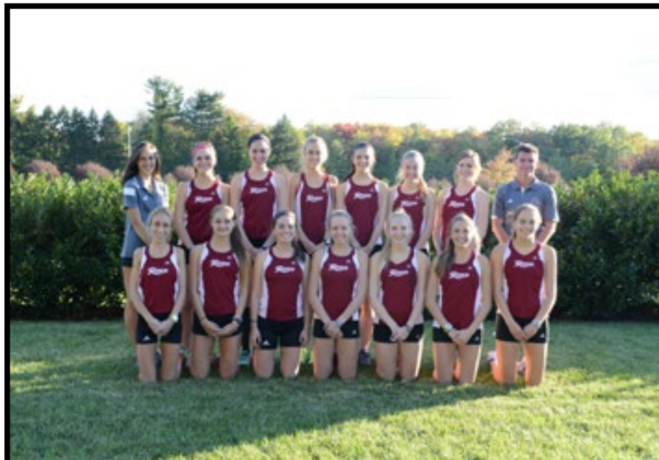
2015 WOMEN'S ROSTER

TWITTER: @RIDERATHLETICS FACEBOOK: /RIDERATHLETICS