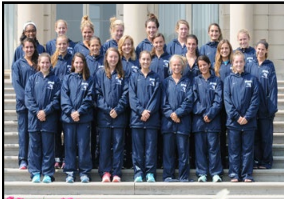
2015 WOMEN'S ROSTER

TWITTER: @MUHAWKS FACEBOOK: /MONMOUTHAWKS