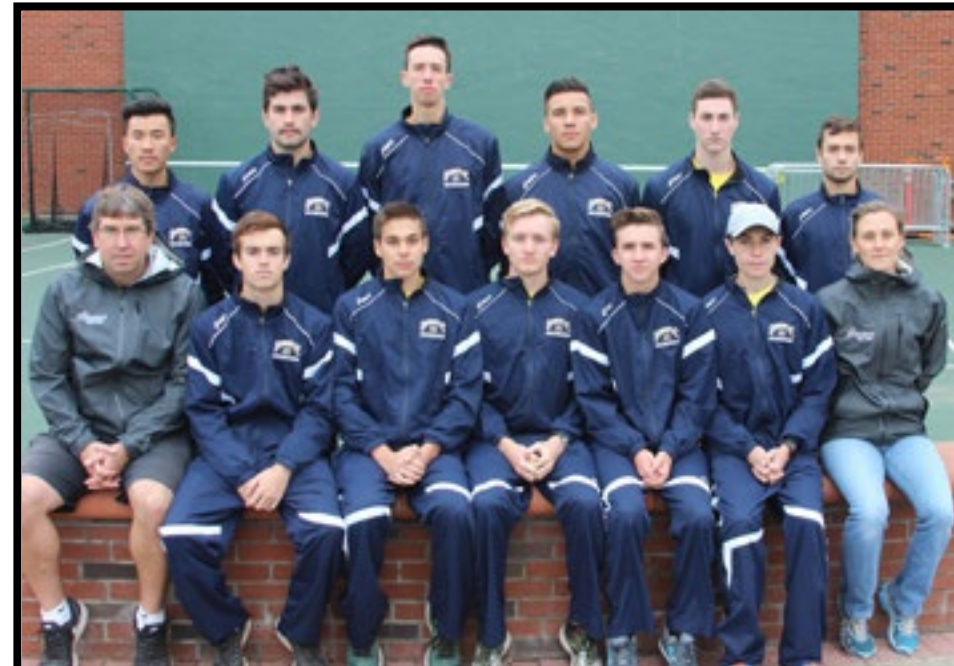
2015 MEN'S ROSTER

TWITTER: @QUATHLETICS FACEBOOK: /QUATHLETICS