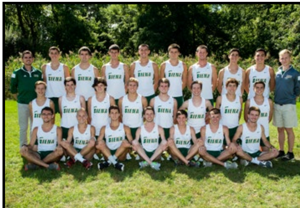
2015 MEN'S ROSTER