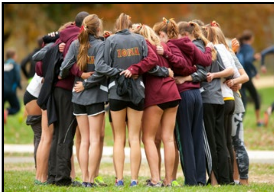
2015 WOMEN'S ROSTER