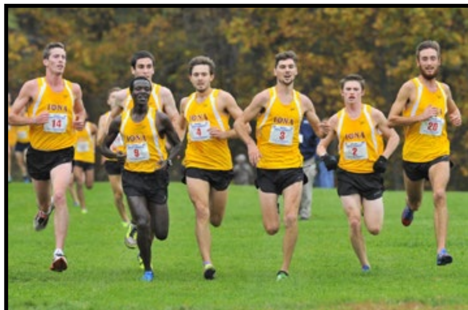
2015 MEN'S ROSTER