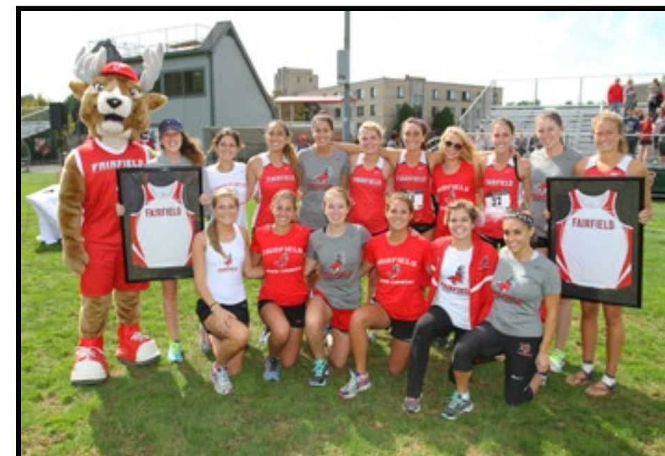
2015 WOMEN'S ROSTER