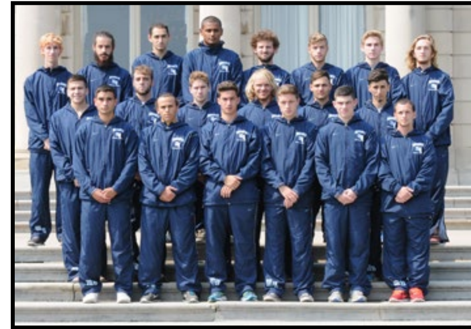
2015 MEN'S ROSTER