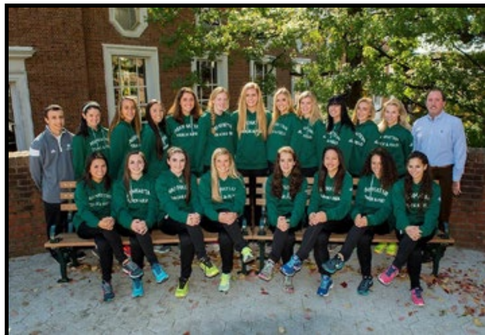
2015 WOMEN'S ROSTER

TWITTER: @GOJASPERS FACEBOOK: /OFFICIALMANHATTANJASPERS