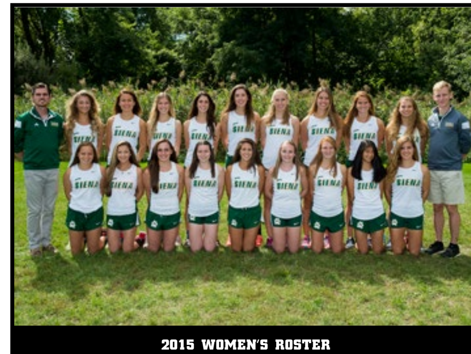
2015 WOMEN'S ROSTER

TWITTER: @PEACOCKNATION FACEBOOK: /SAINTPETERSATHLETICS