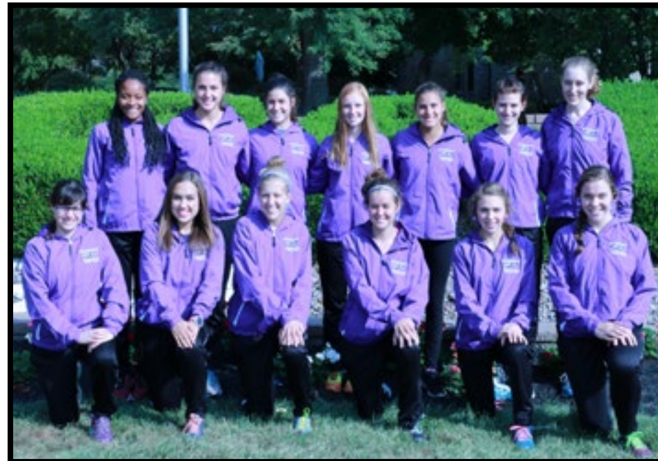
2015 WOMEN'S ROSTER