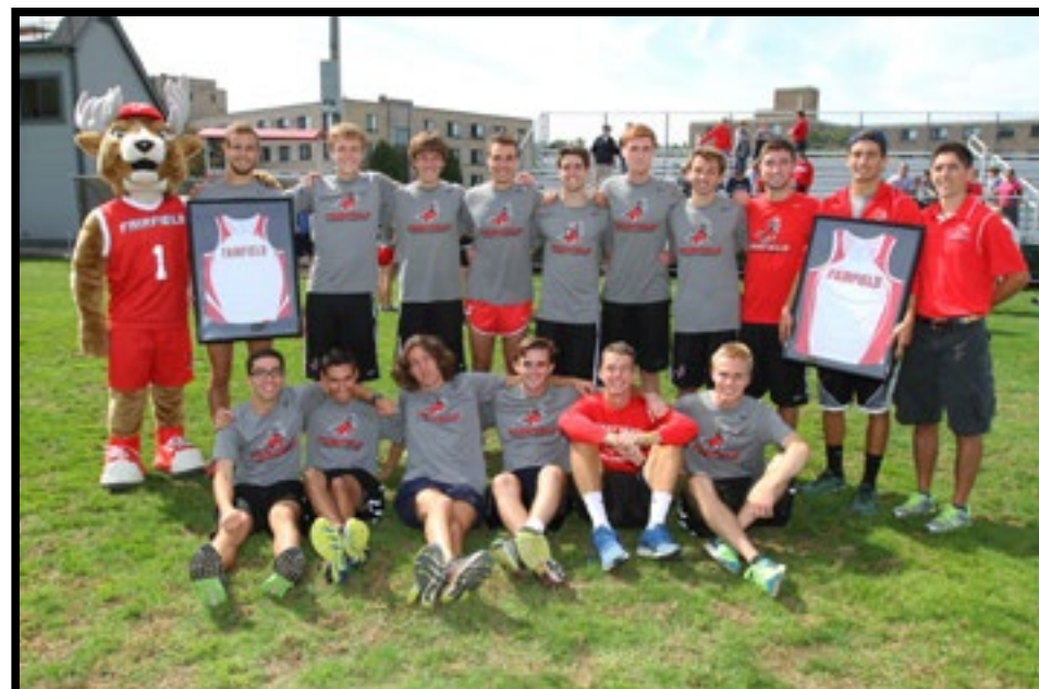
2015 MEN'S ROSTER