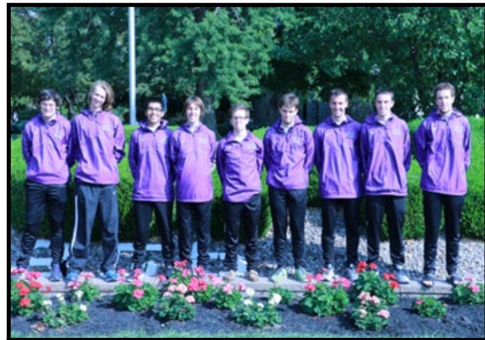
2015 MEN'S ROSTER