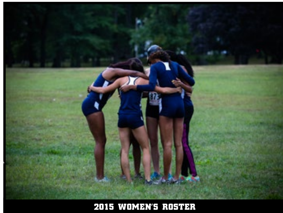
2015 WOMEN'S ROSTER