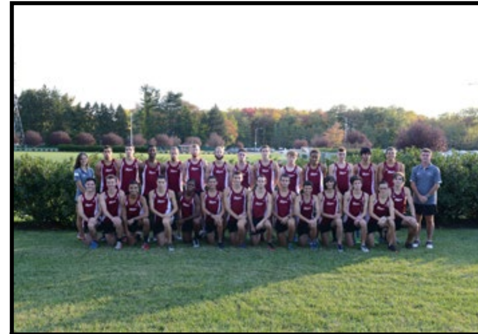
2015 MEN'S ROSTER