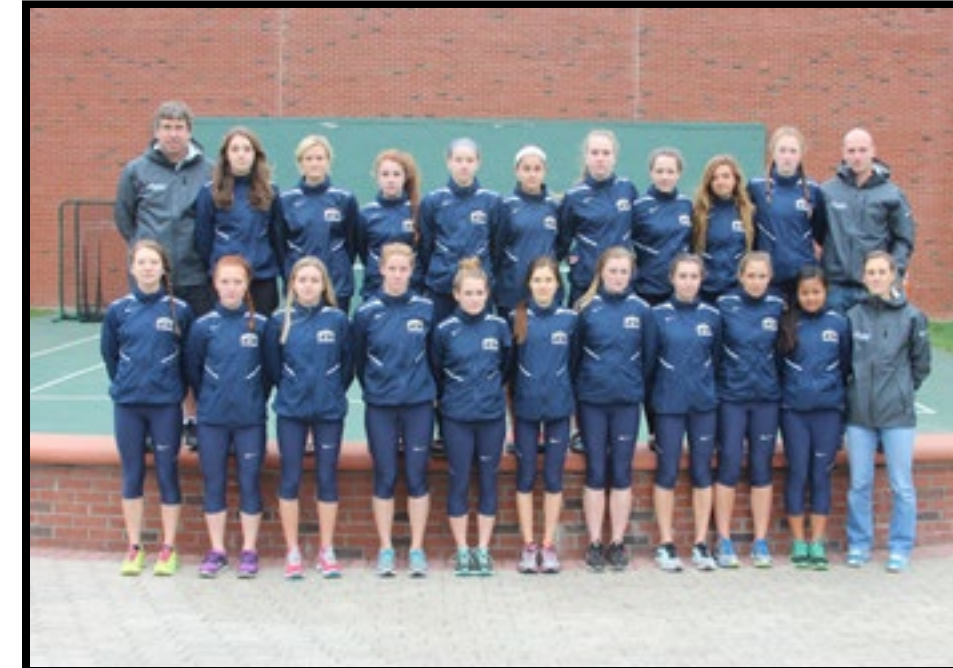
2015 WOMEN'S ROSTER

TWITTER: @NUPURPLEEAGLES FACEBOOK: /PURPLEEAGLES