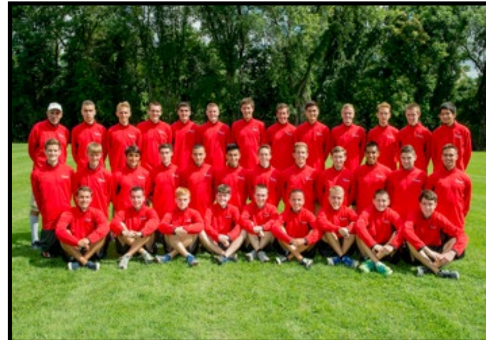
2015 MEN'S ROSTER