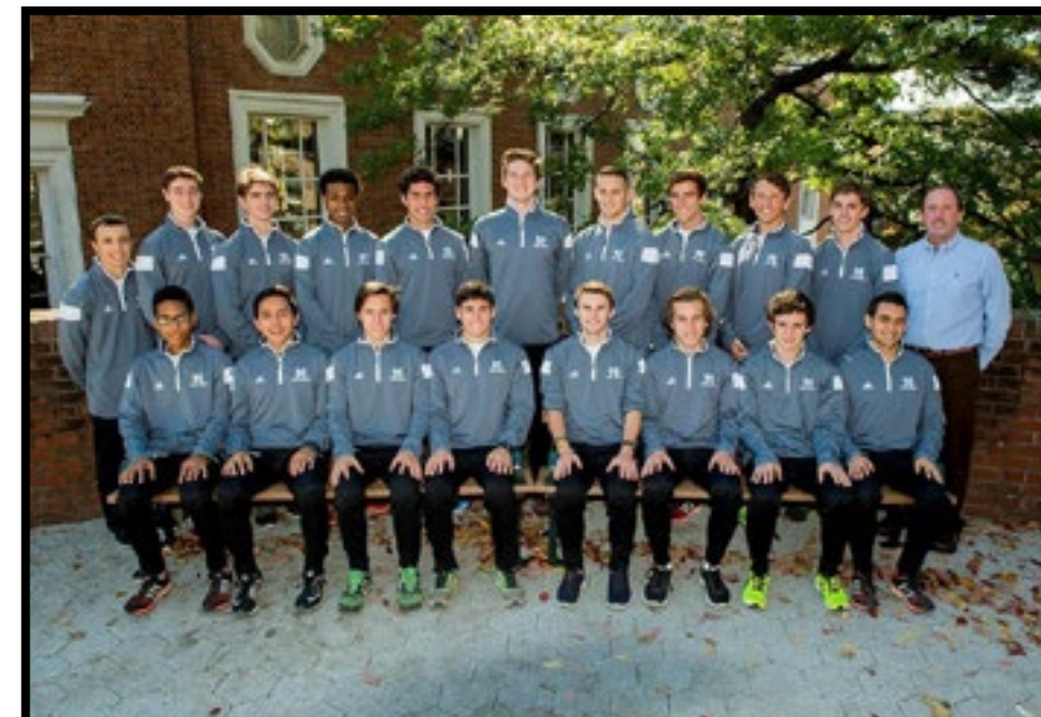
2015 MEN'S ROSTER