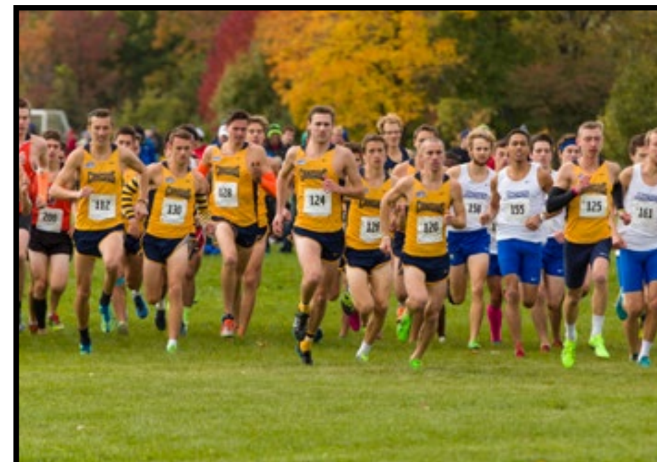
2015 MEN'S ROSTER