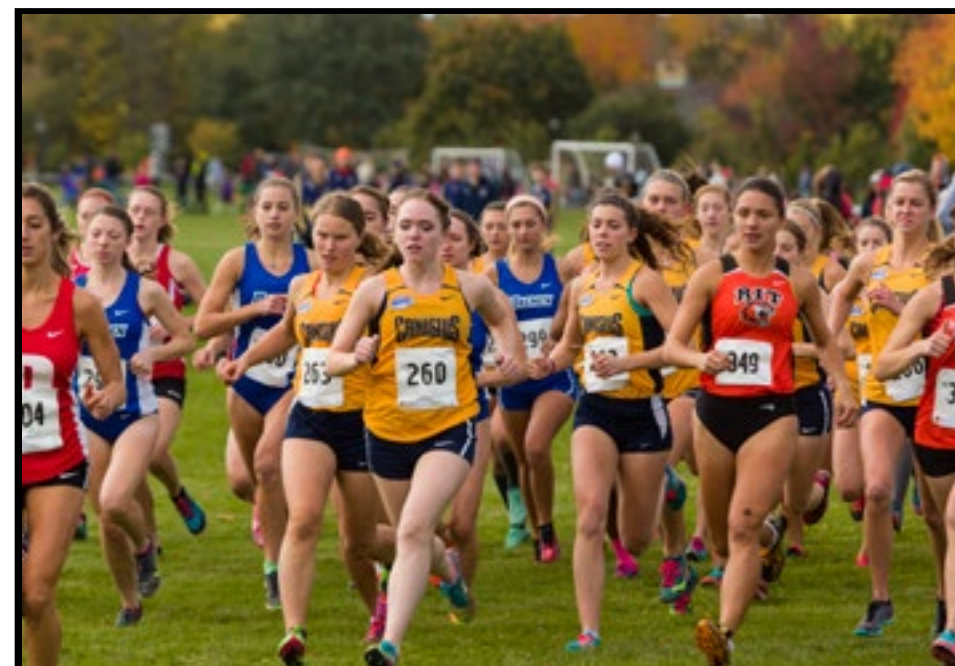
2015 WOMEN'S ROSTER