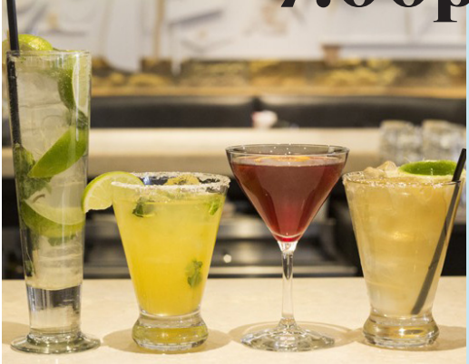
MARGARITAS AT CANTINA Wind down from the workday with a margarita on Cantina's vibrant patio.