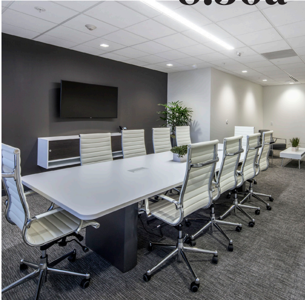
THE CONFERENCE CENTER The new on-site conference center is ideal for hosting the quintessential client meeting.