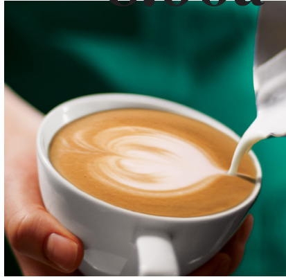
COFFEE AT STARBUCKS Right around the corner from Sevens, Starbucks is conveniently located so you can grab your morning cup on the way into work.