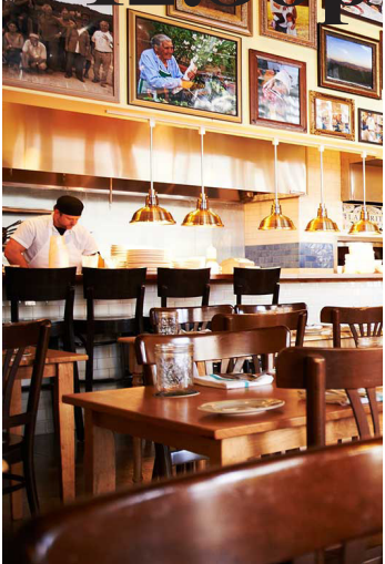
LUNCH AT PASTARIA Just 2 blocks away from the Sevens Building, Pastaria makes an excellent place to meet a client for a quick bite in the middle of the day.