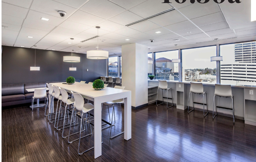
THE LOUNGE The perfect spot for your mid-morning mental break, the tenant lounge is a modern, light filled space with high-end decor and finishes to lighten any mood.