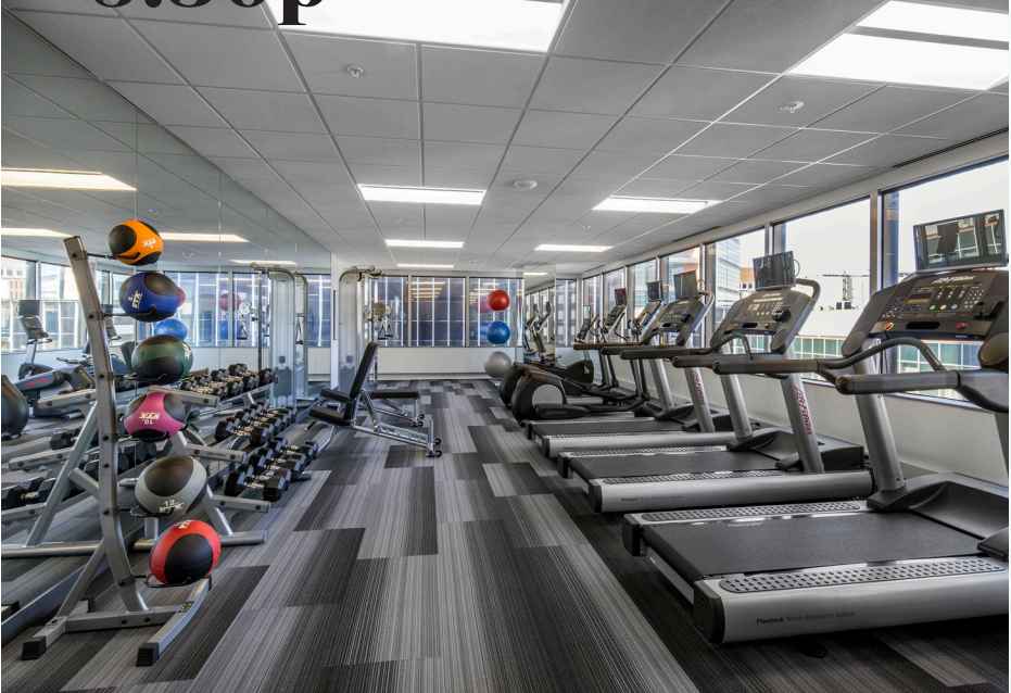
QUICK WORKOUT IN THE ON-SITE FITNESS CENTER The newly renovated Sevens Building offers a new fitness center with high-end equipment and stellar views of Clayton.