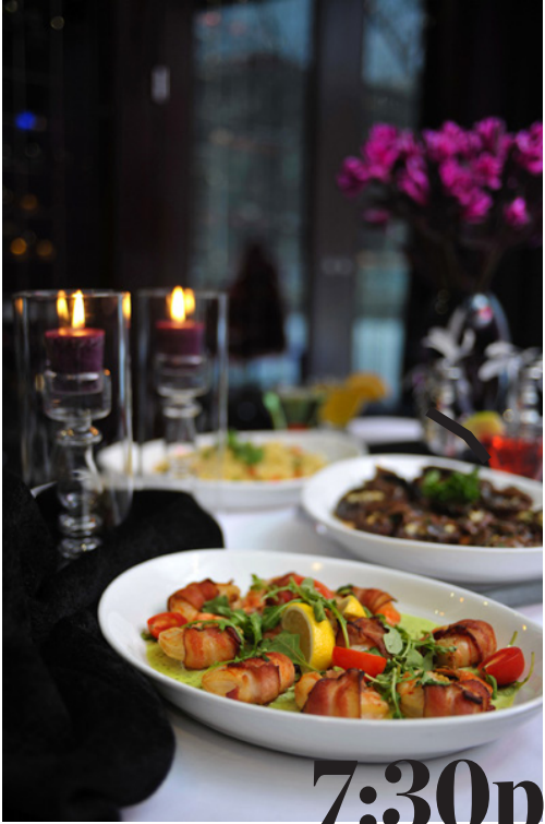
DINNER AT NAPOLI Located around the corner from Sevens Building, family owned and operated Cafe Napoli is the perfect spot to enjoy a decadent meal at the end of the day.