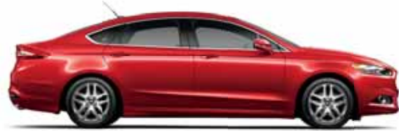
Ruby Red Metallic Tinted Clearcoat 1