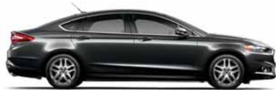
Tuxedo Black Metallic