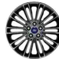
18" Gloss Black Aluminum Optional: SE