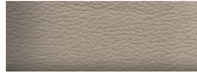
4 Dune Leather