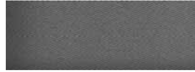
1 Earth Cloth 2