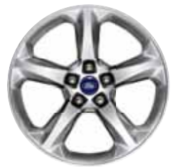
18" 5-Spoke Premium Painted Aluminum Included: Appearance Package