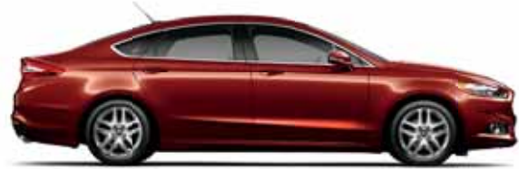
Bronze Fire Metallic Tinted Clearcoat