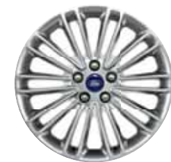
18" Premium Luster Nickel-Painted Aluminum Optional: SE