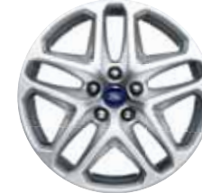
17" Sparkle Silver-Painted Aluminum Standard: SE