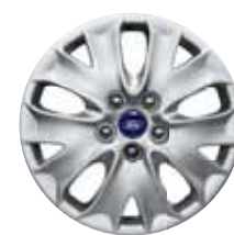
16" Steel with Sparkle Silver-Painted Covers Standard: S

Voice-activated Navigation System (late availability) 2