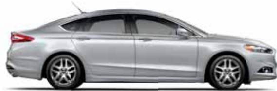
Ingot Silver Metallic