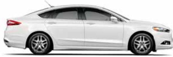
White Platinum Metallic Tri-coat 1