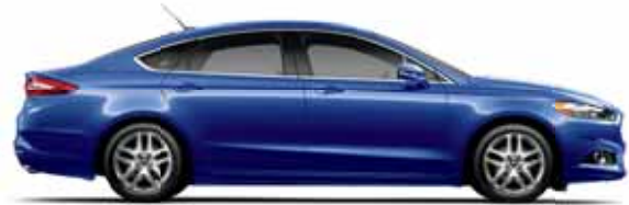
Deep Impact Blue Metallic