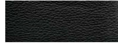
5 Charcoal Black Leather