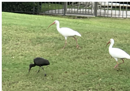
Rare Black Shiny Ibis.