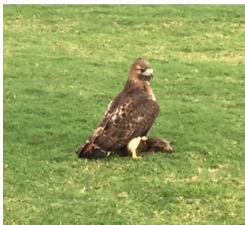
Hawk on South Golf Course