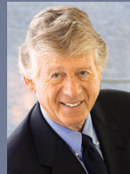
Presented by Central Houston Cadillac