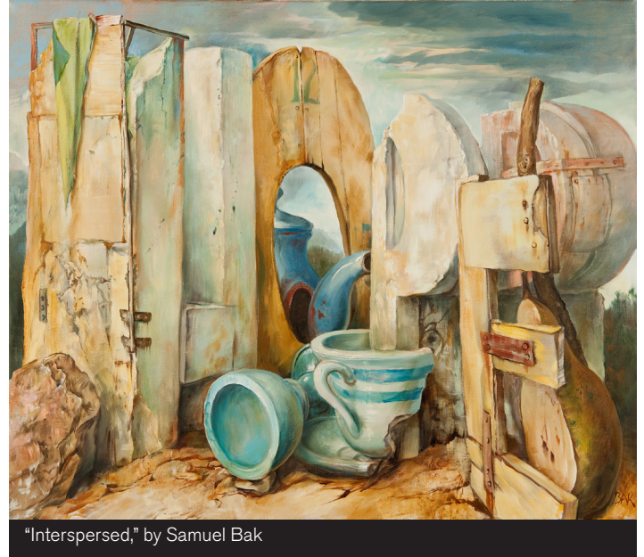
"Interspersed," by Samuel Bak

Bak describes his family as “secular, but proud of their Jewish identity.” Immediately following the German invasion of Poland in September 1939, Vilna and the whole East of Poland was attacked by the USSR.