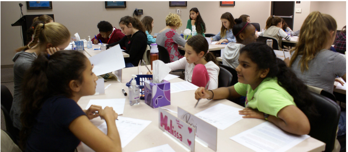
On March 6, 28 Cadette Girl Scouts between the ages of 11 and 13 gathered at the Museum to learn how to be Upstanders. Representing 14 troops across the San Jacinto Council area, the girls joined Museum staff and docents to learn about Holocaust history as well as understand the dangers of hatred, prejudice and apathy in their own lives.