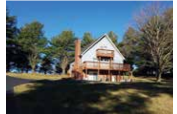
62681 - 2220 SQ. FT. 3 BR, 2 BA, 12' X 20' BUILDING, OPEN DECKS, 2 FIREPLACES! $162,500