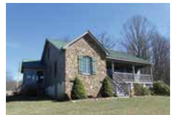
63715 - FANCY GAP - 3BR, 2BA, 1634 SQ.FT. 5 ACRE. REC ROOM & GARAGE. $269,000