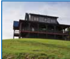
MLS# 62635 - New construction! 2 BR, two BA home w/ breathtaking views. Located in a desirable neighborhood of the Blue Ridge Pkwy. $1,200,000