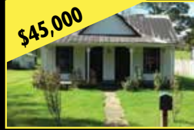
MLS# 59979 - CRIPPLE CREEK - 3BD/1BA home on 0.75 ac. HW floors, National Forest across the road. Creek on property.