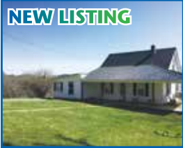
MLS# 64106 - Carroll County 3 BR 1 BA on 7.4 Acres with a pond! Option to purchase adjoining 4 Acres! $134,900

VIEW ALL OF OUR PROPERTIES AT www.galaxrealty.com