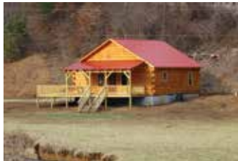
63372 - NEW LOG CABIN WITH 8 ACRES, CREEK. 1088 SQ. FT., 2BR, 2BA. $189,000