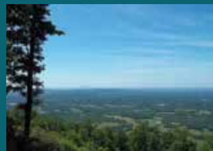
Listing #9734 - $975,000

26 acres just off the Blue Ridge Parkway. Piedmont view, stream, mostly wooded. Owner/Agent