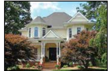
MLS 61692 - Independence - 3 BR, 2 Full BA, 2 Half BA, 2598 Sq. Ft., 5 Ac., large kitchen w/2 ovens & high end appliances, hw floors, walk-in closets, finishings in baths & kitchen, full walk-out bsmt, overlooking private lake. $475,000