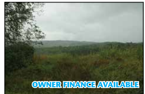
MLS# 61524, MLS# 61527 Two lots, both .96 acre, both $9,950 each. Short ride via horseback to National Forest and horse trails.