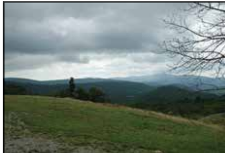
MLS# 48561 3 bedroom, two bath log home, 33.03 Acres. Elevation 4,070 feet! $325,000