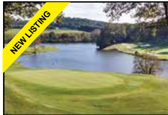
MLS 63896 - Laurel Fork - Lakefront building lot, 0.6 ac., lot #20 overlooking the 11th green, Olde Mill Golf Course, lakeside, cleared for views of lake, clubhouse amenities including restaurant, near Blue Ridge Parkway. $89,000