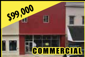
MLS# 62652 - FRIES - Commercial business located on Main St. in Fries. Over 6500 SF & 3 levels for commercial use, with views of The New River. New roof, great for Investors or Business owners.