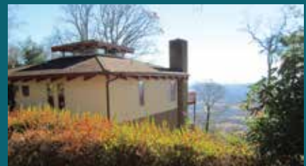
Listing #9817 - $349,000

Small Mountain Cabin on 2 acres. 1 Bedroom, 1 bath. Open Kitchen & living room, rear deck, covered front porch. Very private.