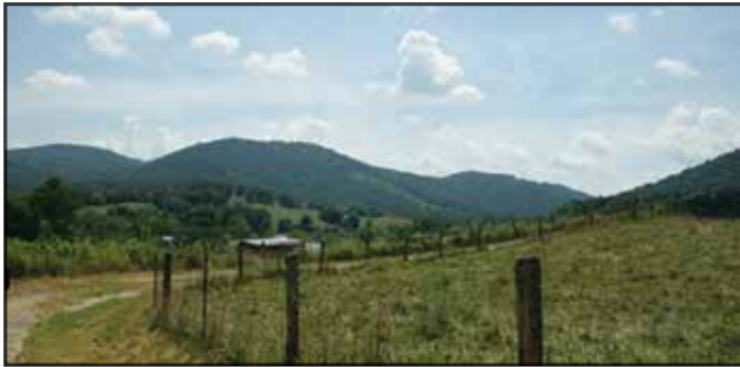
MLS#61151 Beautiful View. 29 Acre Mini Farm!! House, mobile home. Secluded. Plenty of pasture for horses! $155,000