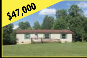
MLS# 60916 - GALAX - 3BD/2BA doublewide home on 2.88 ac. Minutes from NR and New River Trail. Level yard. Spacious LR, wood burning FP.