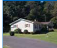
MLS# 63256 - Galax 3 Bed 1 Bath furnished home located on 1.6 Acres. $139,000