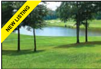
MLS 63895 - Laurel Fork - Building lot, 0.6 ac., lakefront overlooking the 11th Fairway of Olde Mill Golf Course, selectively cleared, golf course offers clubhouse, restaurant, fitness facilities, & course, private location, views, near Blue Ridge Parkway. $69,000