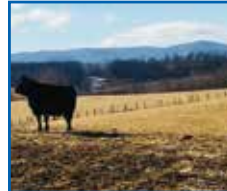
MLS# 63131 - Cripple Creek 61 acres with 2002 doublewide. $414,000