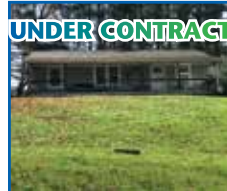
MLS# 62640 - Private cabin on 6 acres. 2 bed, 1 bath, pond must see! $89,900