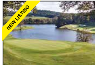
MLS 63898 - Laurel Fork - Lakefront building lot, 0.6 ac., lot #21 overlooking the 11th green, Olde Mill Golf Course, lakeside, cleared for views of lake, clubhouse amenities including restaurant, near Blue Ridge Parkway. $89,000