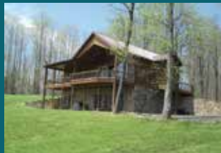
Listing #9844 - $349,000

3 bedroom, 3 bathroom, 2 Fireplaces. Has been superbly maintained. Amazing wide range views of Pilot Mountain