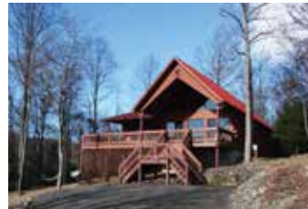
63215 - PIEDMONT VIEW HOME 1360 SQ. FT., 2 BR, 2 BA, PAVED DRIVEWAY $225,000