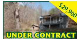
Galax, 2 BR, 1 BA, just out of the city limits.