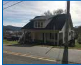
MLS# 62570 - Duplex with three apartment units! Great location and Galax. $100,000