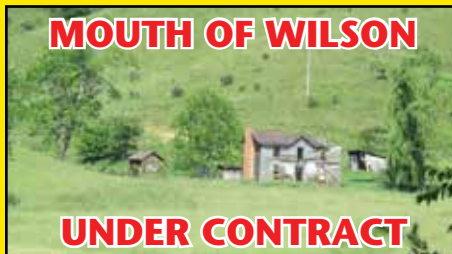
MOUTH OF WILSON

MLS# 55346 - 885 PRIDEMORE ROAD - 155 acre farm. Older 2 story home. Barn. Crooked Creek flows through the property. Paved road frontage on both sides of the road. 50% open. $3500 per acre.