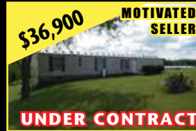
MLS# 60080 - MAX MEADOWS - 3BD/1.5BA home on 2.35 ac. with a view. Open floor plan that is in move in condition. Heat pump and propane. Great place for horse lovers.