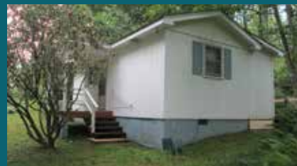
Listing #9857 - $39,900

Great Mountain Home! Large master suite on main level and 2 bedroom and full bath on 2nd level. Great Piedmont views!