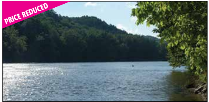
MLS# 56847 3 Lots on the New River, 2 Awnings, Storage Building. Deck at the river. $135,000