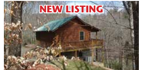
64017 - TWO LOG CABINS ON LITTLE REED ISLAND CREEK! 1BR, 1BA, 480SQ. FT., 4 GUESTS EACH! INVESTMENT PROPERTY! $225,000