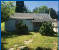
MLS# 60471 - Grayson County! 2 bed 1 bath bungalow. Great fixer upper! $28,000