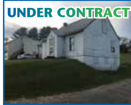
MLS# 63584 - Prime location in Hillsville! Great flea market income! 3 bed 2 bath! $51,900