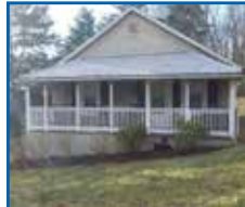
MLS# 59600 - 2 BR one bath that sits 11.3 acres close to the New River. Very private a must see! $114,000