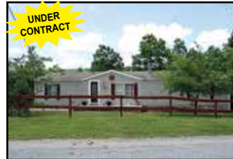
MLS 60658 - Max Meadows - 4 BR, 2 BA, 1512 sq. ft., doublewide on 5.01 acres, new carpet, spacious living room w/fireplace, newly painted kitchen, large deck. $79,500