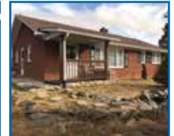
MLS# 63377 - Secluded 3 BR 1 BA home w/ full unfinished bsmt. Almost 5 acres of land. With appliances. In Fries, VA. $115,000