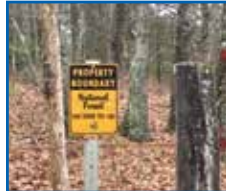
MLS# 63021 - Ivanhoe, 3 Bed 2 Bath home situated on 22 Ac. Borders Jefferson National Forest. $420,000