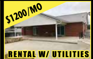
MLS# 62809 - HILLSVILLE - 3Bd/2Ba apartment for rent. Walking distance to Main St. & shopping. Apartment has many updates, includes kitchen cabinets, counters, appliances, etc. Rent includes utilities, water, cable, internet & trash pick up.