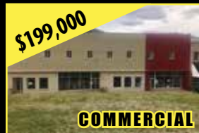
MLS# 62654 - FRIES - Commercial business located on Main St. in Fries. Over 12000 SF & a store front with much potential. Business has 25+ parking, elevator, extra storage, plus much more.