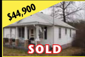
MLS# 63355 - AUSTINVILLE - Cute 2 BR cottage with view of New River. HW floors, enclosed back porch, close to New River and New River Trail.