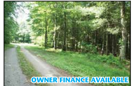
MLS# 56554 5.95 Acres in Galax. Wooded, Public Water Available. $19,950