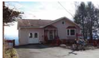
62886 - CASCADE MOUNTAIN RESORT: PIEDMONT VIEW, 1 BR, 2 BA, 1768 SQ FT, 4-CAR GARAGE $176,000