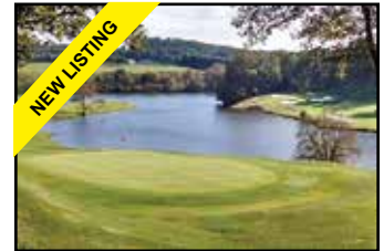
MLS 63899 - Laurel Fork - Building lots, 1.2 ac., 2 lots # 20 & 21, located side by side, lakeside, cleared for lake views, clubhouse amenities including restaurant, private, outdoor activities, beautiful dream home site, near Blue Ridge Parkway. $165,000