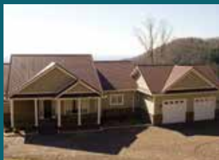
Listing #9810 - $699,000

Piedmont View Chalet- 3 bedroom, 2 baths, open floor design, located on Orchard Gap. Close to Blue Ridge Parkway and a short distance to Mt. Airy. Outbuilding for extra storage.