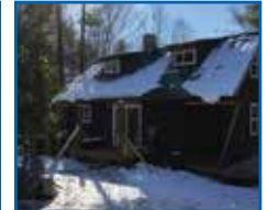
MLS# 62848 - New construction! Fries, Three bed two bath situated on 6 acres! $189,000