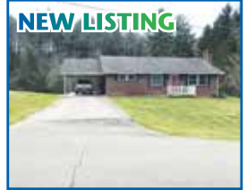
Nice brick ranch in Galax! 2 bed 1 bath full basement. $115,000