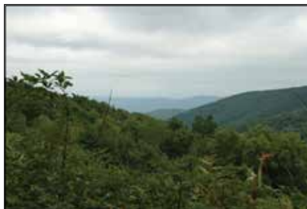
MLS# 48801 51.01 Acres, Near horse trails. Elevation 4,070 feet! $247,500