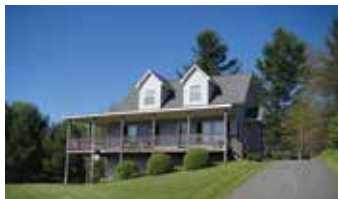
60041 - HIGH CHAPARRAL- 3BR, 2.5BA, 1512 SQFT, IMMACULATE CONDITION. $185,000