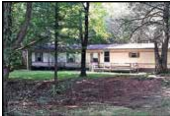
MLS 61775 - Troutdale - 3 BR, 2 BA, Singlewide, completely furnished, well & septic, 2.36 Ac., rolling creek, abundant wildlife, walking trails, nice permanent or recreational home, located near Grayson Highlands State Park. $45,000