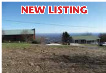
63568 - PIEDMONT VIEW LOT IN CHALET HIGH SUBDIVISION. COMMUNITY WATER & POWER. $29,900