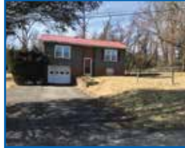
MLS# 63274 - 3 Bed 2 Bath Home near hospital. Option To purchase adjoining 2 acres. $115,000