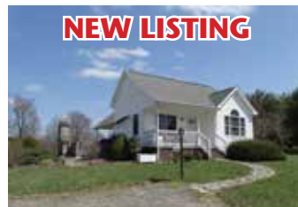
64173 - HOME WITH BUFFALO MOUNTAIN VIEW! 1048SQ. FT., GAS LOG FIREPLACE. $139,000