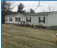
MLS# 62870 - Hunters paradise! Nice 4 BR 3 bath home in Austinville situated on 24 acres! $189,000