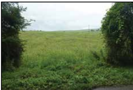
MLS# 61519, MLS# 61520, MLS# 61521, Multiple tracts, Short ride via horseback to National Forest, Various prices, Owner Finance Available