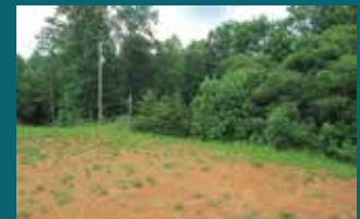
Listing #9846 - $59,900

Two Tracts totaling over 132 acres with an established road to the property. Located on Groundhog Mountain in Patrick County, Virginia. Just off the Parkway.