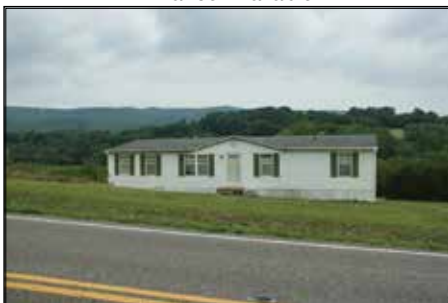
MLS# 61237 1.38 Acres, 3 bedroom, 2 bath manufactured home. Beautiful View! $85,000