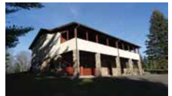
62682 - PIEDMONT VIEW HOME IN CHALET HIGH, 2306 SQ. FT., 3 BR, 3 BA, 2 CAR DRIVE UNDER GARAGE. $199,000