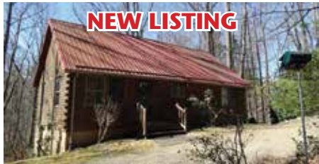
64114 - LOG HOME ON 4.6 ACRES. 3 BR, 2 BA, 2022 SQ. FT. SEVEN SPRINGS DEVELOPMENT. $179,000