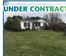
MLS# 62572 - Super nice 3 bedroom 2 bath home with basement. Located in country setting. $99,900