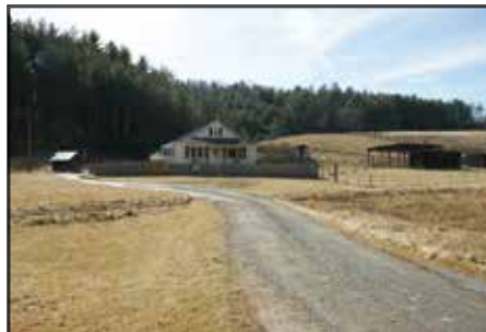
MLS# 63731 1.6 Acres, 3 bedroom, 1 bath home, barn, Horse Trail Access! $149,900