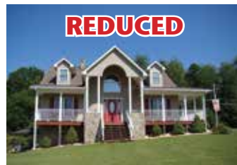
58838 - 3 BR, 3.5 BA, 2228 SQ. FT., 1.1 ACRES, OPEN DECK, PORCH COVERED, CATHEDRAL CEILINGS, CANA. $190,000