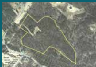
Listing #9849 - $129,900

Best View in Fancy Gap! New 4 bedroom, 3.5 bath house, huge great room, screened in covered deck - all upscale features in this mountain home. Must see this new home and the view! Gated driveway.