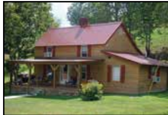
MLS 57316 - Elk Creek - 2 BR, 1.5 BA, Cabin on 1 ac w/ creek, renovated electrical, plumbing, interior/exterior, MBR/laundry on first floor, close proximity to NR, NF and other trails. $79,900