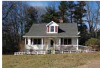
63024 - FANCY GAP- 2BR, 2BA, 1636 SQ. FT., 2.81 ACRES $137,000