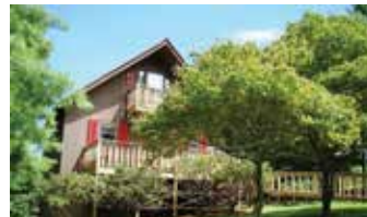
57110 - HIGH CHAPARRAL - CABIN 4BR, 2BA, FURNISHED, 1248 SF. $119,900