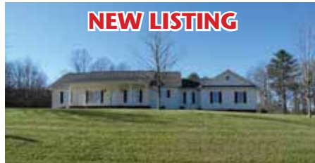
64125 - BUFFALO VIEW HOME! 1722 SQ. FT., 3 BEDROOMS, 3 BATHS, 10.5 ACRES, GARAGE $259,000