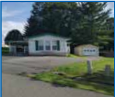
MLS# 60951 - Beautifully remodeled home in Galax, 2 BR 2 BA great location, close to everything. $69,900