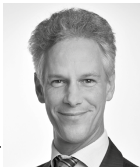
What is your assessment so far, 12 months after the creation of the business line?

The results are very positive. The creation of the business line has clearly enhanced the