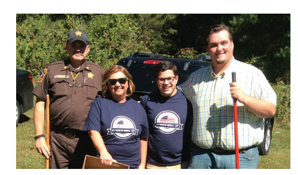
Volunteers from Farris Funeral Service are pictured spending time on a service project at the Washington County Sheriff's Office

The last project was with the Washington County Sheriff's Office. With sponsorships from The Clifton Companies and Farris Funeral Service, volunteers picked up trash and landscaped the county firing range.