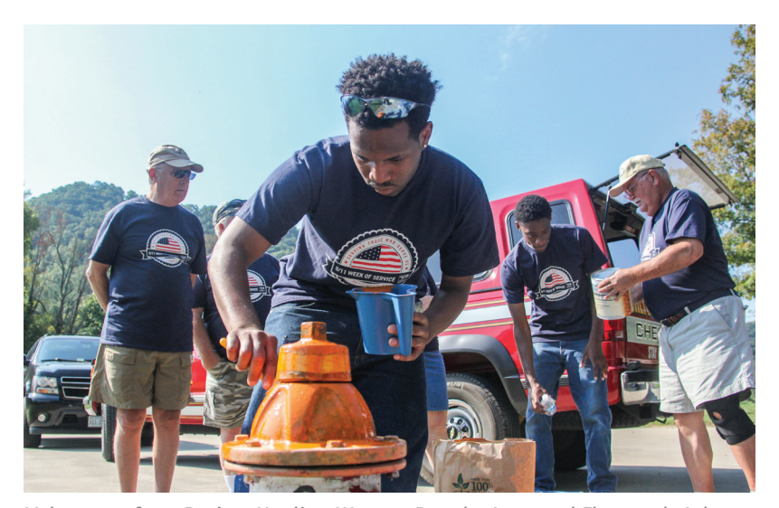
Volunteers from Project Healing Waters, People, Inc., and Flatwoods Job Corp begin painting fire hydrants at the Hiltons Virginia Fire Department

First responders were invited to submit projects which, in turn, volunteers helped to complete. Volunteers and companies from across the region showed their support and appreciation this year. Thanks to numerous volunteers and sponsors, it was a pretty amazing week.