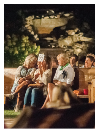
Live Auction Bidding