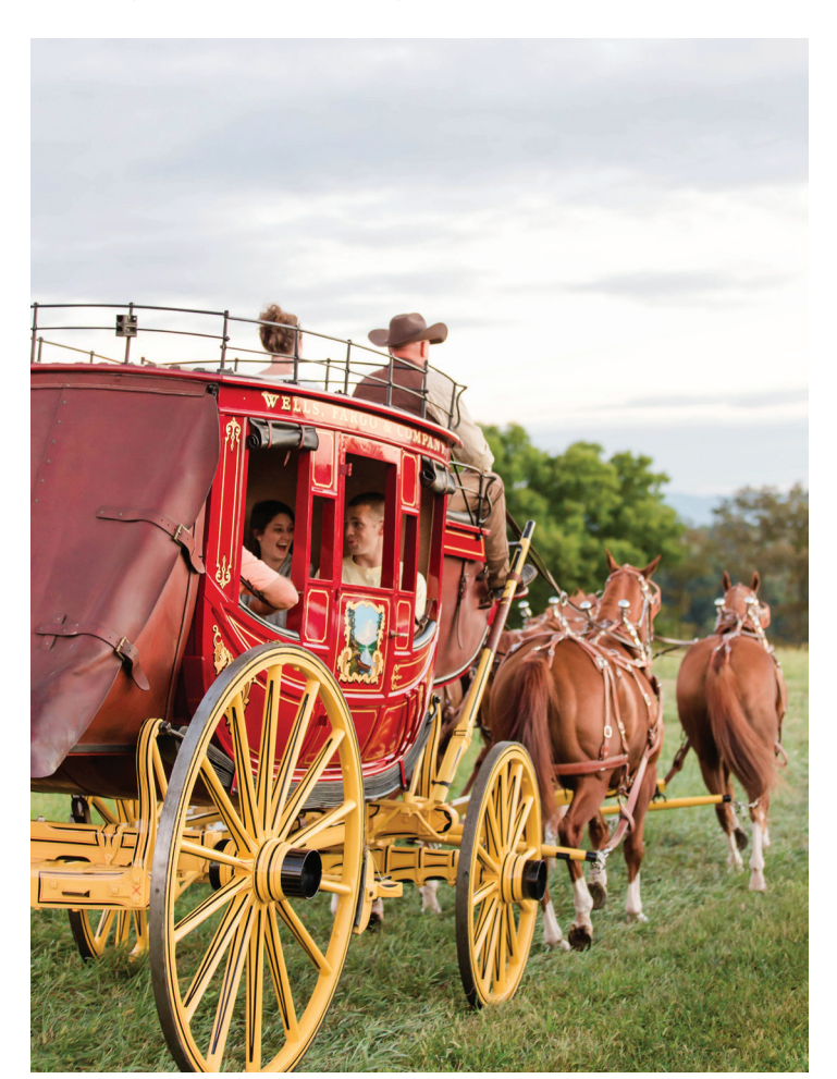
Guests take a ride on the Wells Fargo stage coach

The event saw nearly 200 people from the community come together for the western-themed fund-raiser, which included music by the band Time Sawyer, a silent and live auction and free stagecoach rides on the Wells Fargo Stagecoach.