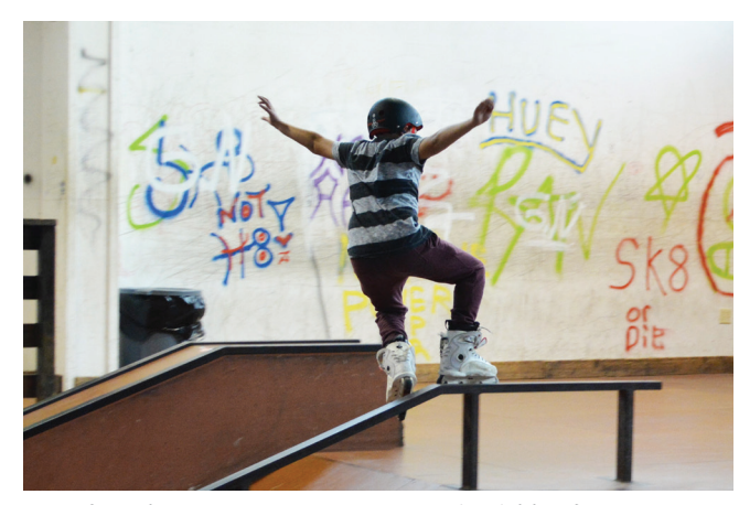
A student skates at Teen Venture Center in Richlands, VA during a visit from United Way of Southwest Virginia