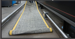
Industrial Safety Mats