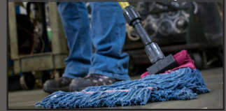
Wet & Dust Mops