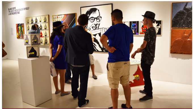
LEMIEUX GALLERIES DURING THEIR REGIONAL FINALS OF THE BOMBAY SAPPHIRE ARTISAN SERIES.