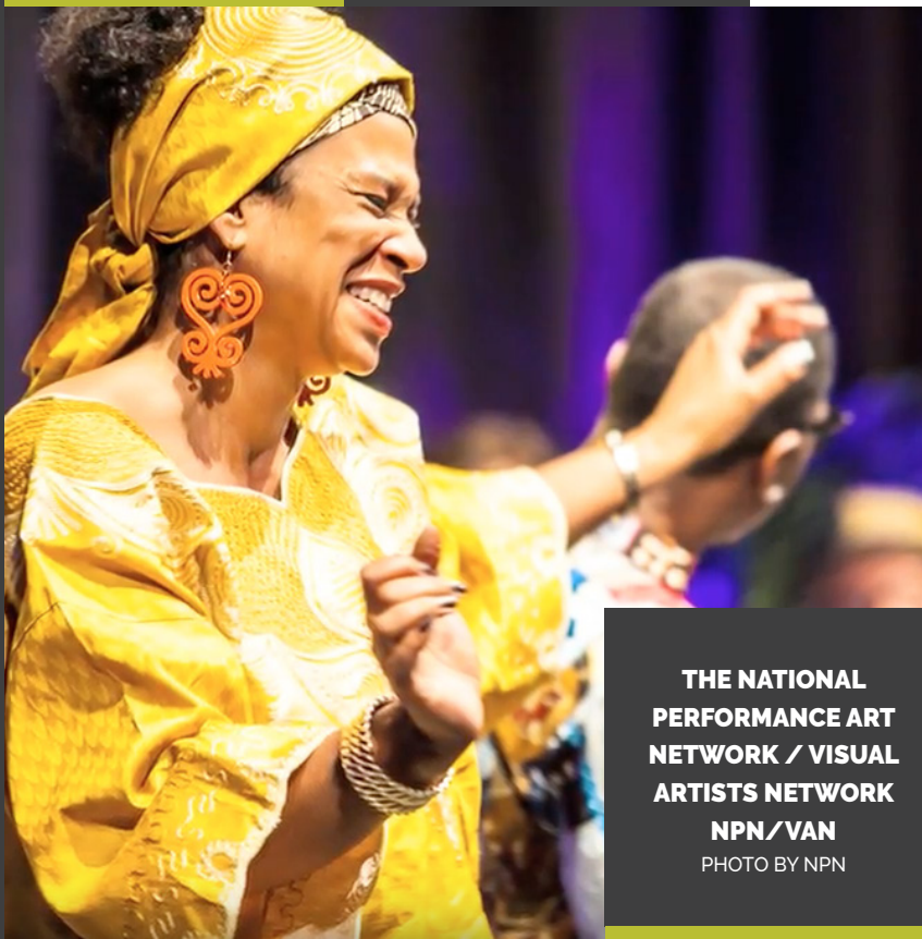
THE NATIONAL PERFORMANCE ART NETWORK / VISUAL ARTISTS NETWORK NPN/VAN

NPN/VAN is a national organization supporting artists in the creation and touring of contemporary performing and visual arts. NPN/VAN is committed to community engagement as well as sharing ideas and knowledge. NPN/VAN represents artists who create unique works and support the presenters who take risks in showcasing them. NPN/VAN has brought innovative performing artists to all corners of the United States for more than 25 years. NPN/VAN addresses issues of artistic isolation and the economic constraints of moving art around the country and the sharing of artistic and community voices. As an artist-centered, field-generated network, NPN/VAN is unique in its structure. Its active and engaged network of presenters form an interconnected web of relationships through which support and services are strategically designed, effectively distributed, and successfully leveraged. Npnweb.org