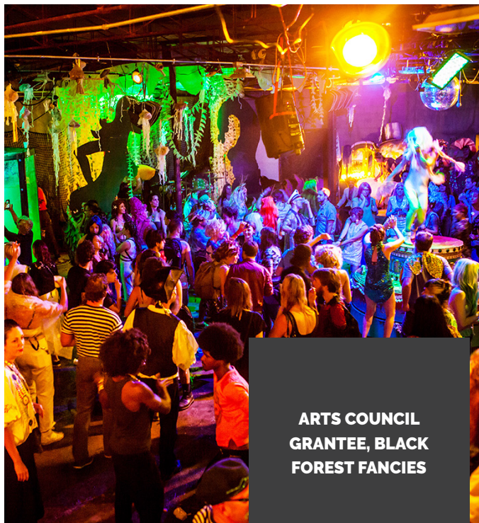
ARTS COUNCIL GRANTEE, BLACK FOREST FANCIES