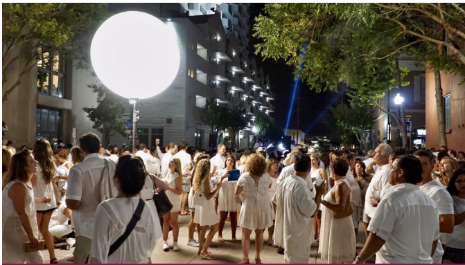
WHITE LINEN NIGHT ON JULIA STREET