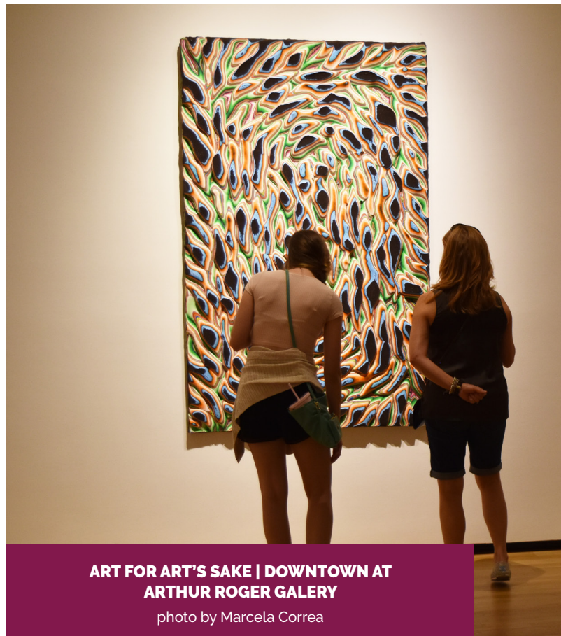
ART FOR ART'S SAKE | DOWNTOWN AT ARTHUR ROGER GALLERY

The Arts District Association strives to connect all aspects of the visual arts, culinary arts, and musical arts, along with the art of travel in this sought-after neighborhood.