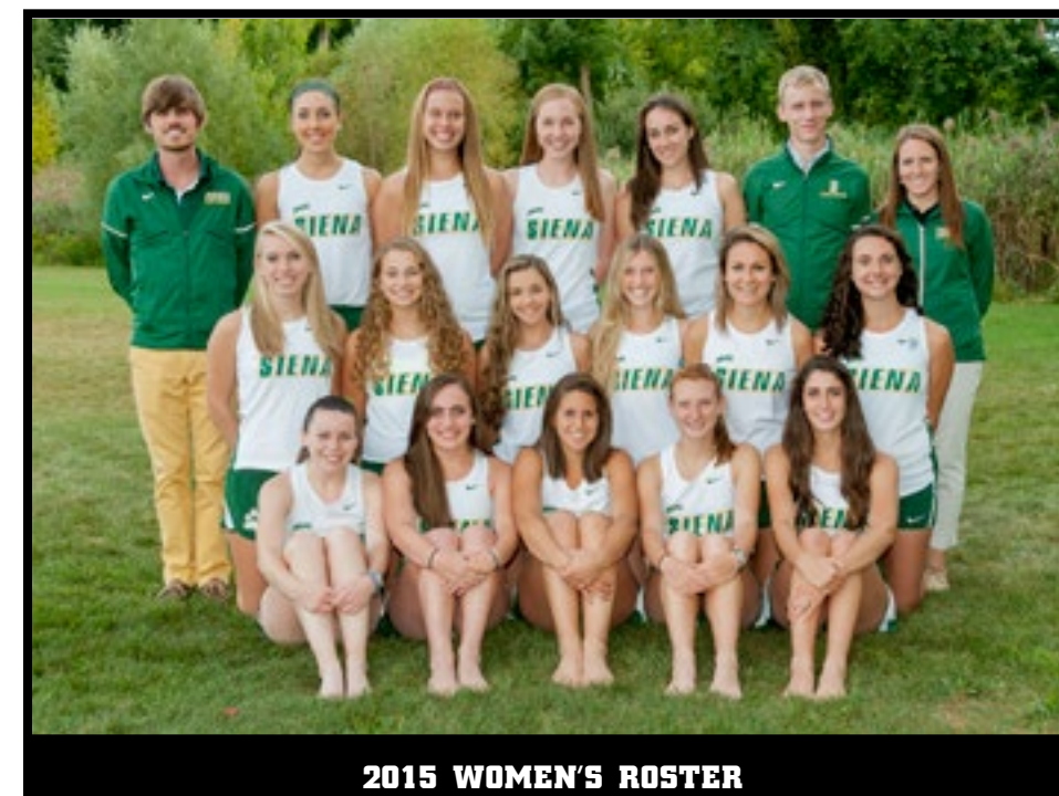
2015 WOMEN'S ROSTER