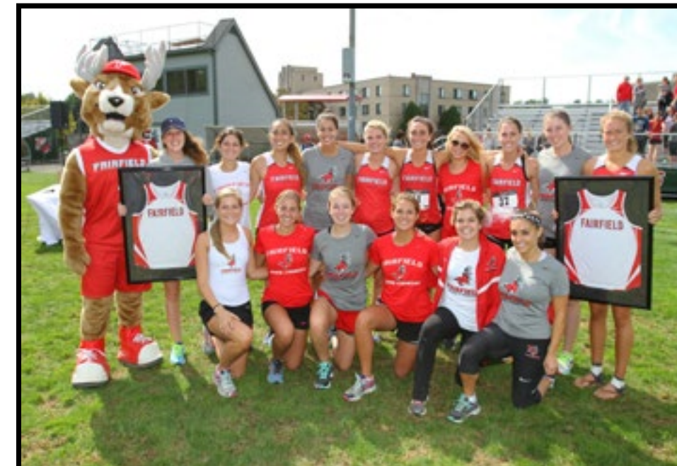
2015 WOMEN'S ROSTER