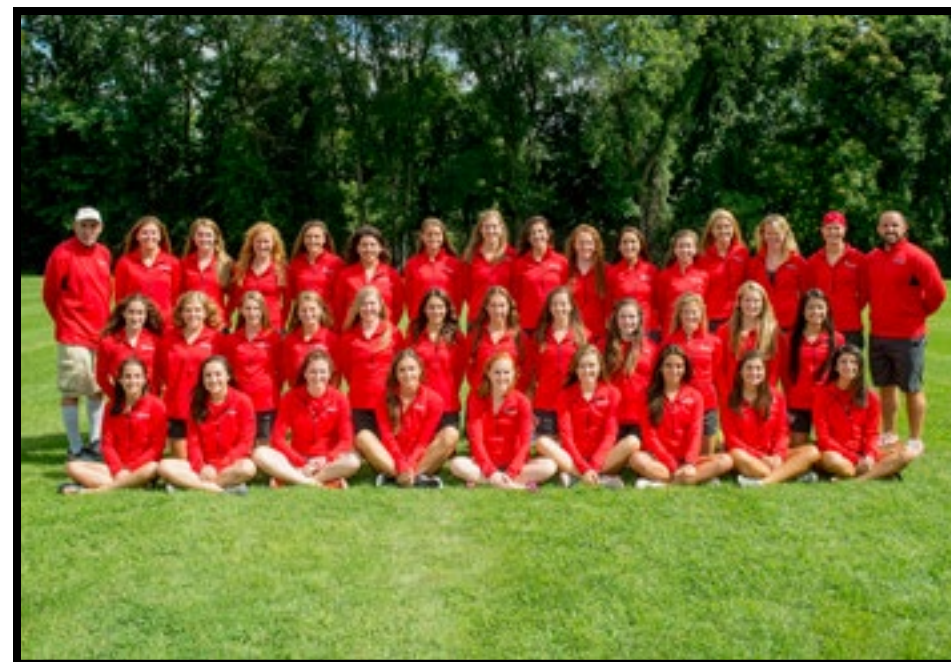
2015 WOMEN'S ROSTER