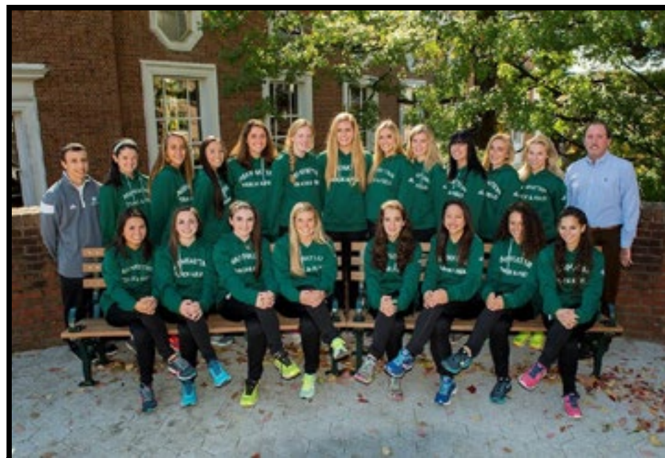
2015 WOMEN'S ROSTER

TWITTER: @GOJASPERS FACEBOOK: /OFFICIALMANHATTANJASPERS