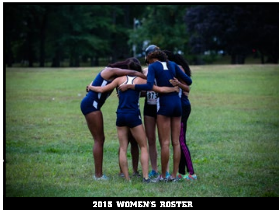
2015 WOMEN'S ROSTER

TWITTER: @PEACOCKNATION FACEBOOK: /SAINTPETERSATHLETICS