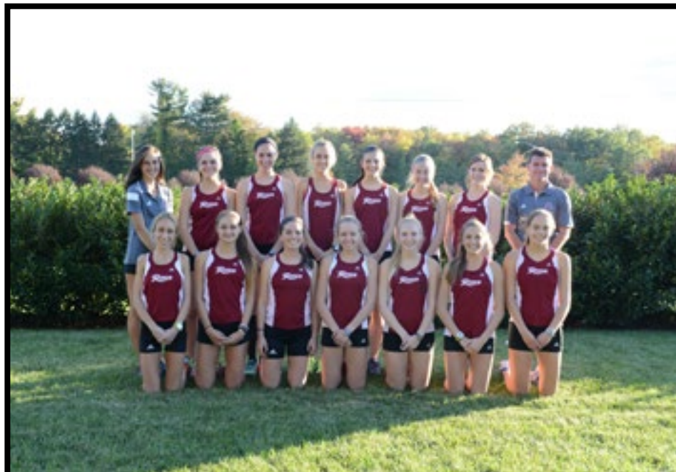
2015 WOMEN'S ROSTER

TWITTER: @RIDERATHLETICS FACEBOOK: /RIDERATHLETICS