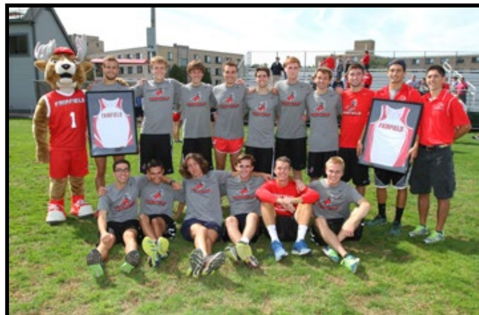
2015 MEN'S ROSTER