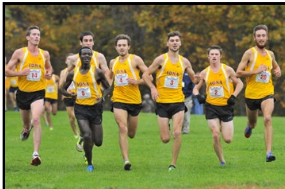
2015 MEN'S ROSTER