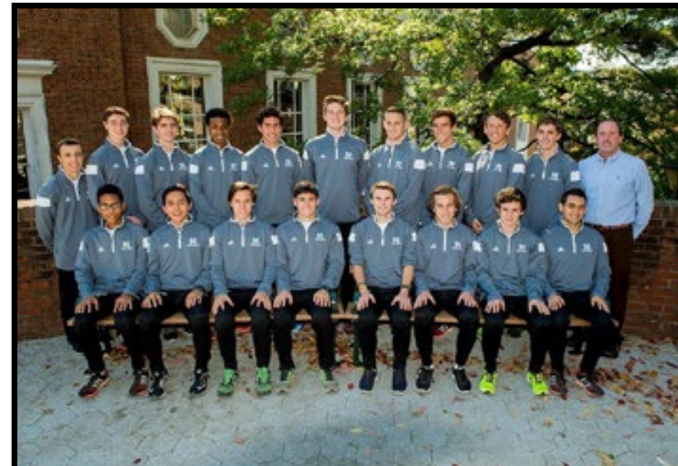
2015 MEN'S ROSTER