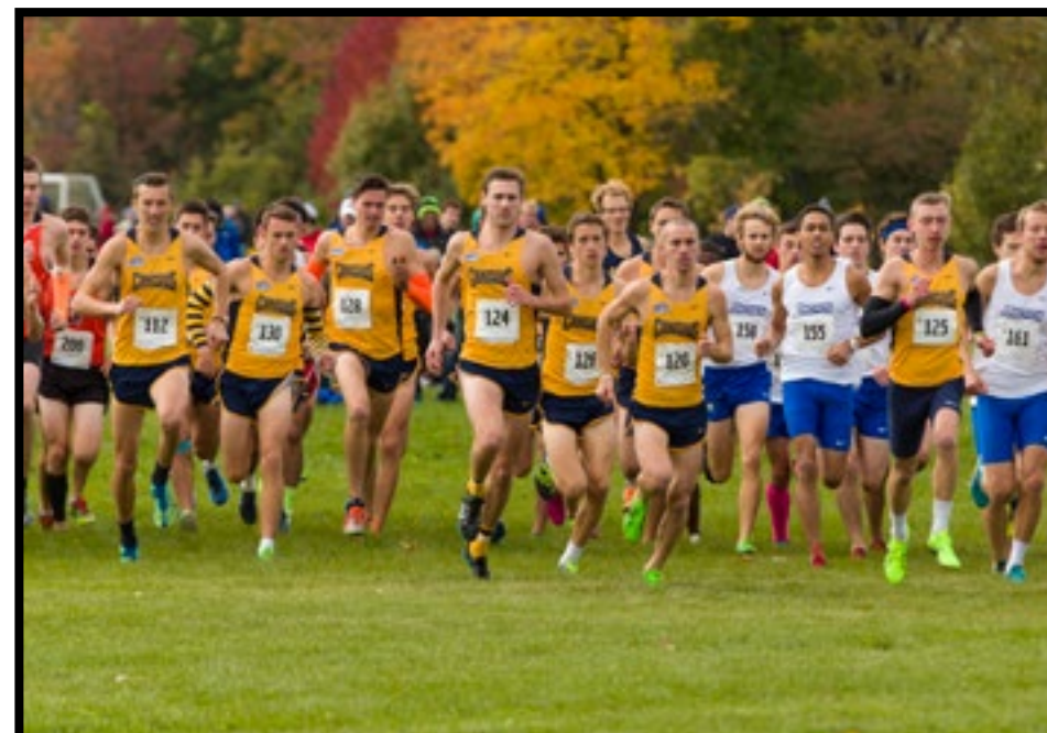
2015 MEN'S ROSTER