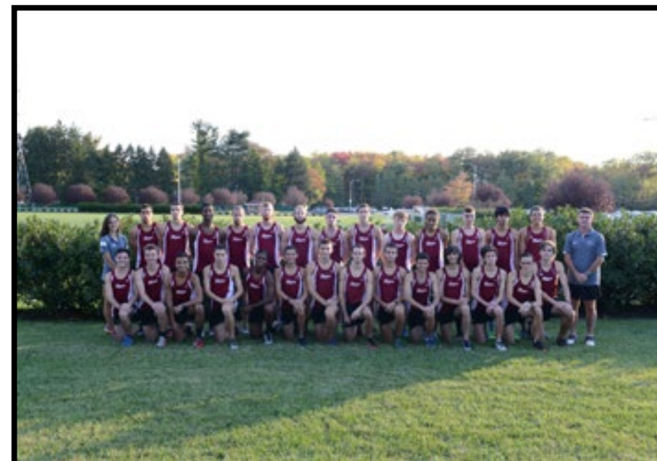
2015 MEN'S ROSTER