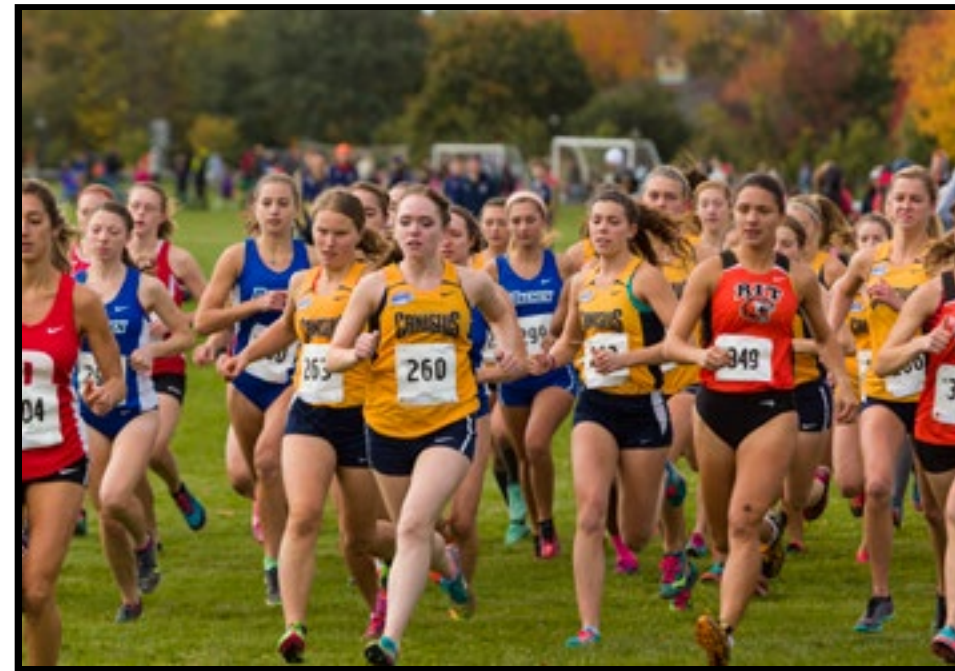
2015 WOMEN'S ROSTER