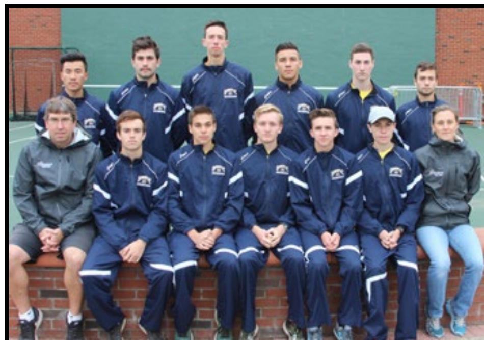
2015 MEN'S ROSTER

TWITTER: @QUATHLETICS FACEBOOK: /QUATHLETICS