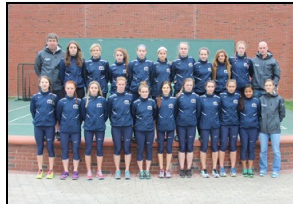
2015 WOMEN'S ROSTER

TWITTER: @NUPURPLEEAGLES FACEBOOK: /PURPLEEAGLES