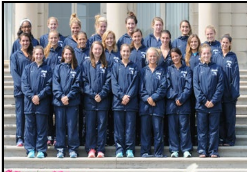
2015 WOMEN'S ROSTER

TWITTER: @MUHAWKS FACEBOOK: /MONMOUTHAWKS