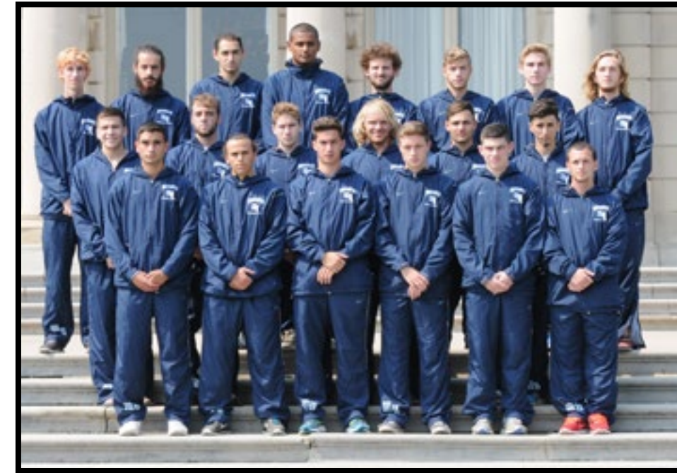
2015 MEN'S ROSTER