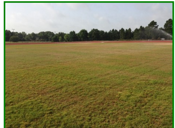
July, 12 2016