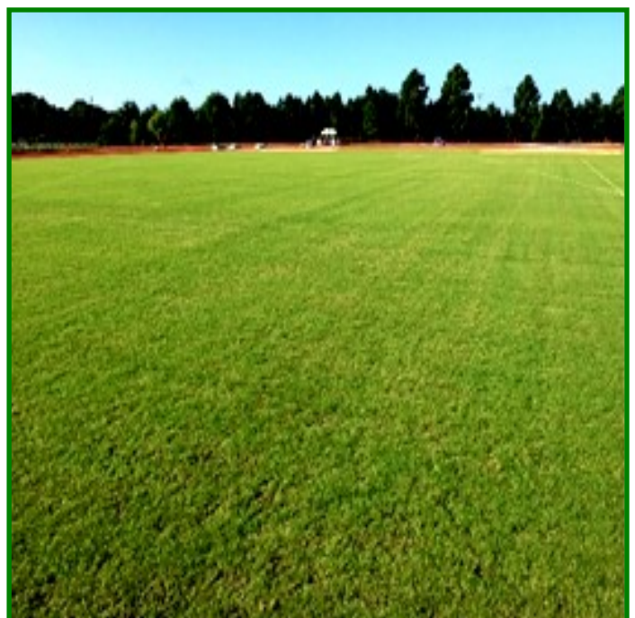
August 2, 2016