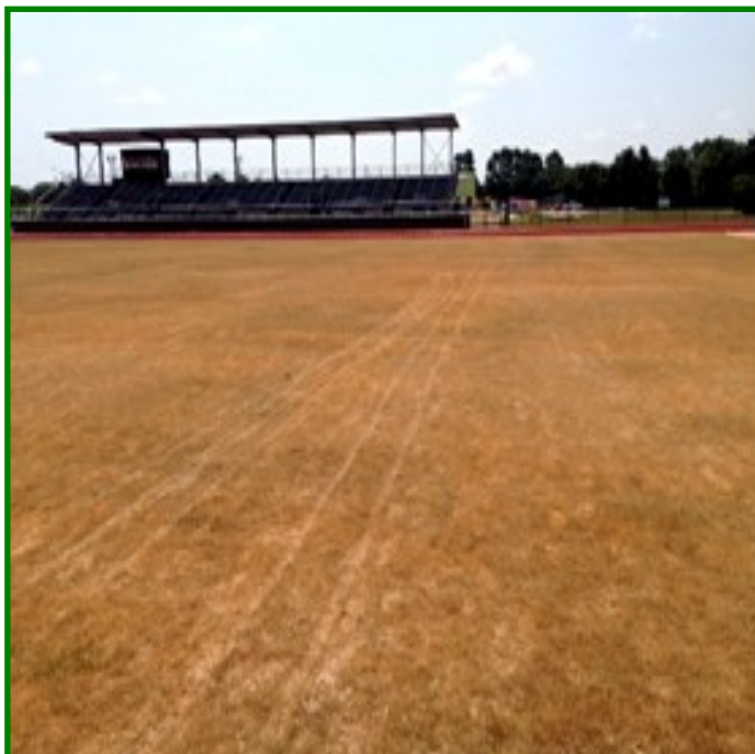
June 27, 2016