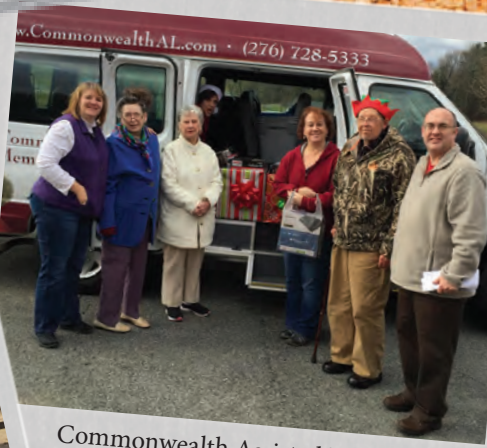
Commonwealth Assisted Living Friends bring Christmas donations