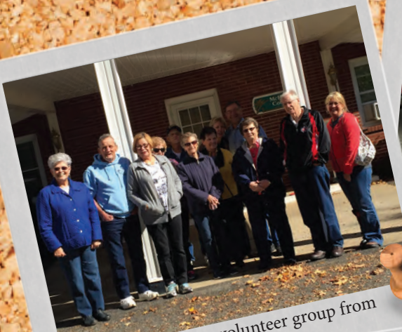
Shearer Presbyterian volunteer group from Mooreville, NC