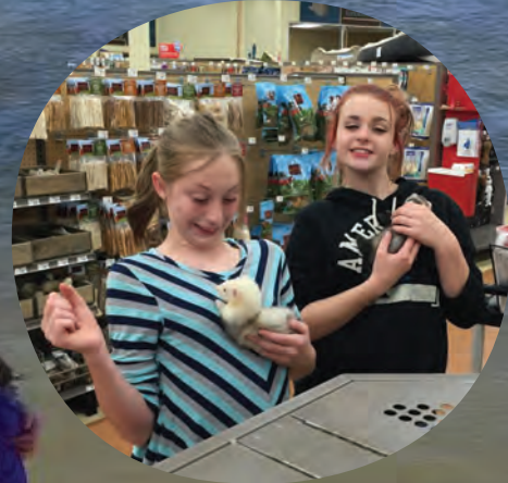
FERRET OUT all of the interesting stories and information inside!