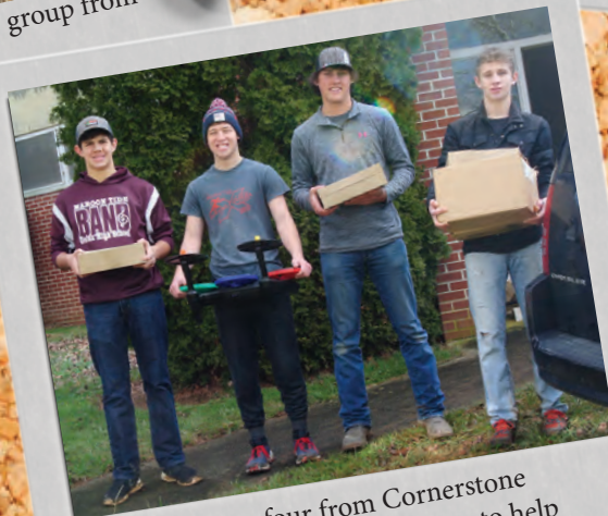
Four of forty-four from Cornerstone Christian Fellowship who came to help