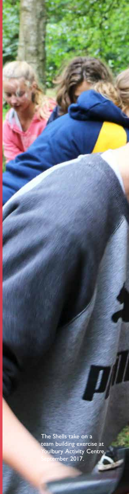
The Shells take on a team building exercise at Youlbury Activity Centre, September 2017.