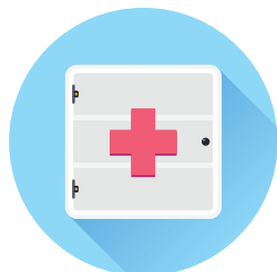
URGENT CARE CENTER