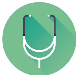
WALK-IN DOCTOR'S OFFICE