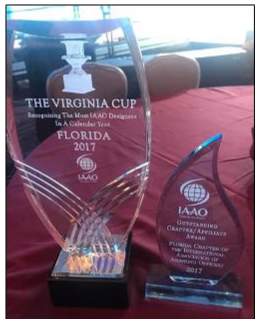
As 90's R&B artist Montell Jordan famously sang, "This is How We Do It!"