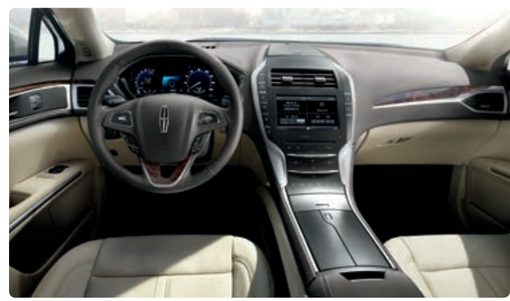
Light Dune Leather