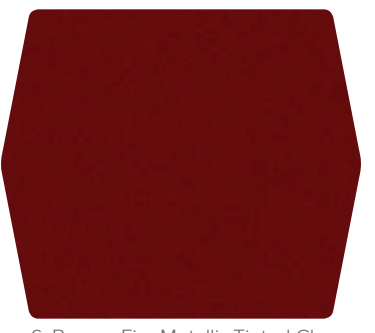
6. Bronze Fire Metallic Tinted Clearcoat ^{\rm 1}