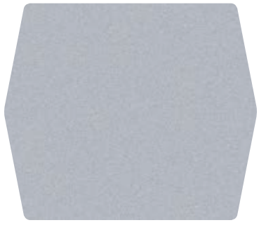
4. Ingot Silver Metallic