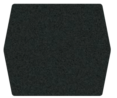
3. Guard Metallic