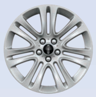
18" Premium Painted Aluminum Standard