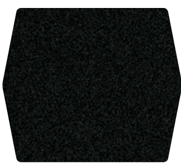
8. Tuxedo Black Metallic