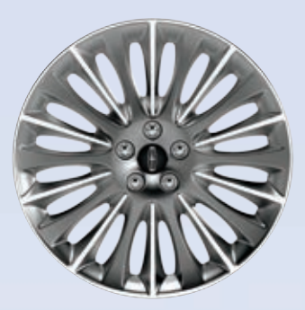
19" Polished Aluminum with Dark Tarnish-Painted Pockets Available on Reserve<sup>1</sup>