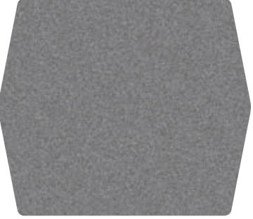
2. Luxe Metallic