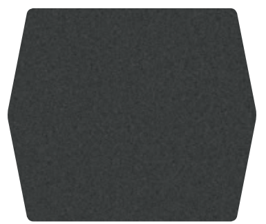
7. Magnetic Metallic