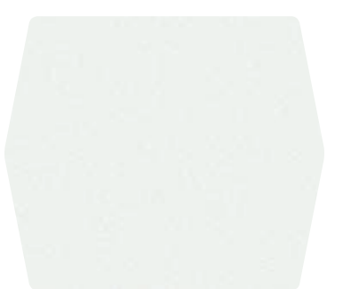
5. White Platinum Metallic Tri-coat<sup>1</sup>