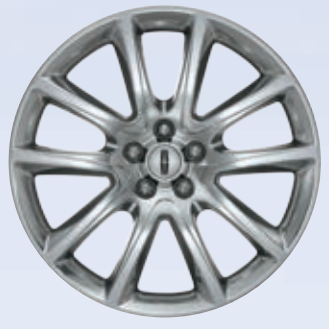
19" 10-Spoke Polished Aluminum Optional<sup>1</sup>