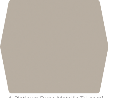
1. Platinum Dune Metallic Tri-coat<sup>1</sup>