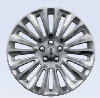
19" 18-Spoke Polished Aluminum Optional<sup>2</sup>