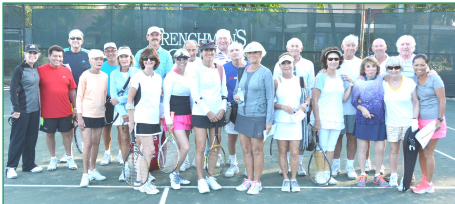
Our Round Robin Participants

Badminton anyone? A Pickleball court may be used for Badminton also and the equipment is available.