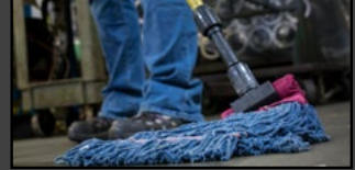
Wet & Dust Mops