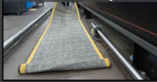
Industrial Safety Mats