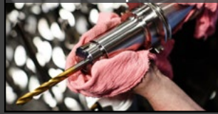
Ultra™ Shop Towels