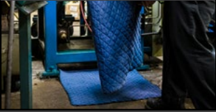
Sorbblts® Oil Absorbents