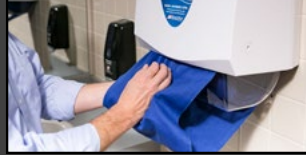
Cotton Roll Towels