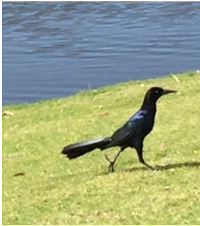
Boat Tail Grackle