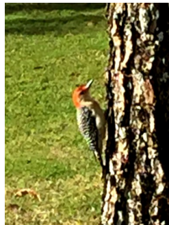
Red Bellied Woodpecker