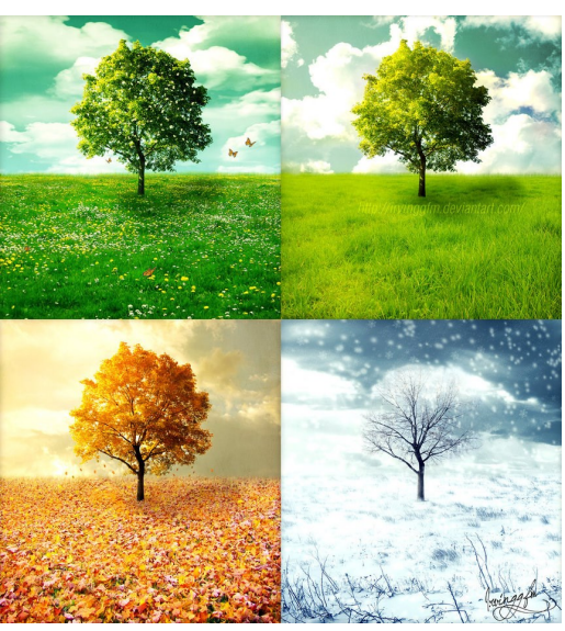
To Everything there is a Season . . .

Well, spring is a time of action, people busy trying to get things done they could not do during the winter months. Sort of a renewing of the mind, spirit, of many things GOOD! Hopefully this special season will bring awesome happenings your way as your year unfolds. Wouldn't it be great to simply just grab your favorite book along with your favorite lounge chair, set it right down in your favorite spot somewhere, outside or next to your window, while looking out on a beautiful Spring day and simply 'RELAX". Yea, that would be nice. My hope is that you will get to something like that on more than one occasion this Spring. Really enjoy the place you call home! The NEXT season will be here before you know it.