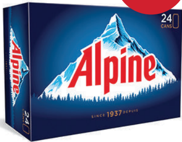
Alpine 24 Pack Cans