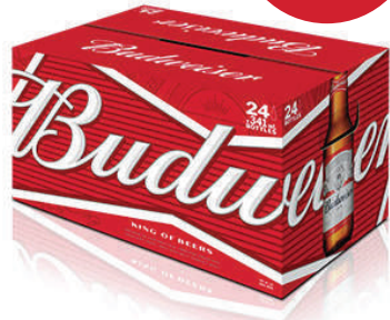
Budweiser 24 Pack Bottles