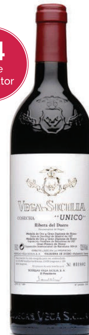
2007 Bodegas Vega Sicilia Ribera del Duero Unico