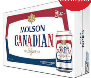
Molson Canadian 24 Pack Cans