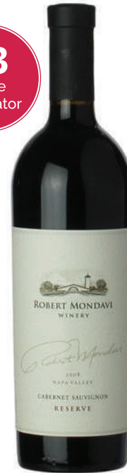
2008 Robert Mondavi Cabernet Sauvignon Reserve Napa Valley