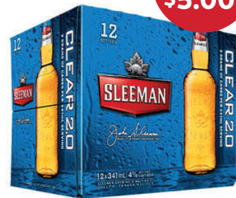
Sleeman Clear 12 Pack Bottles