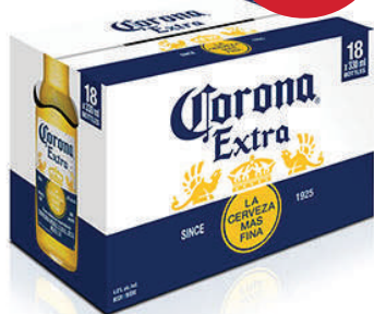
Corona 18 Pack Bottles