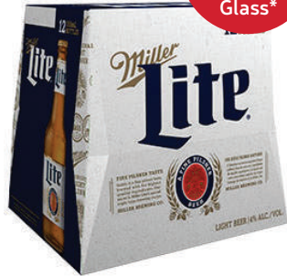
Miller Lite 12 Pack Bottles