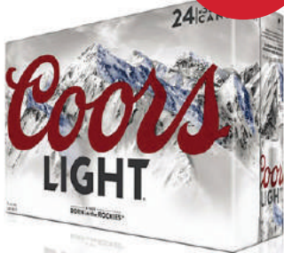
Coors Light 24 Pack Cans