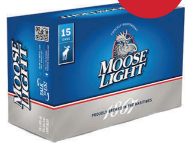
Moose Light 15 Pack Cans