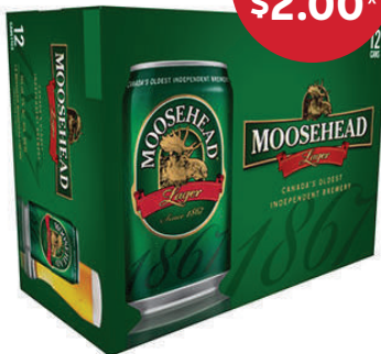
Moosehead Lager 12 Pack Cans