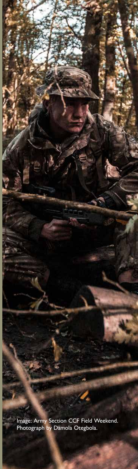
Image: Army Section CCF Field Weekend.