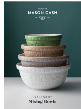
In The Forest Mixing Bowl A5 POS 6504.016