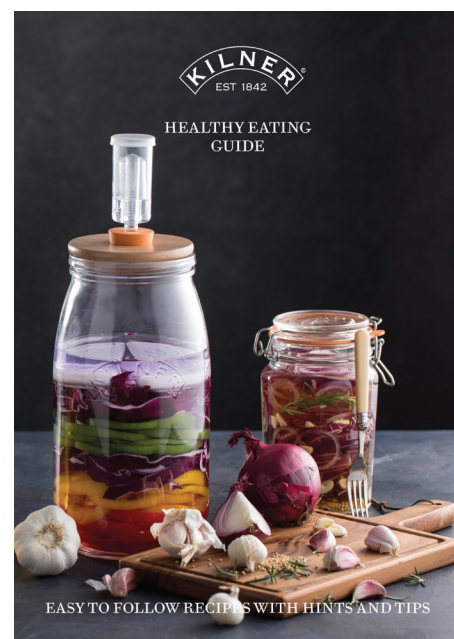
Kilner® Healthy Eating Guide W10.5 x H14.5 inch 6500.089