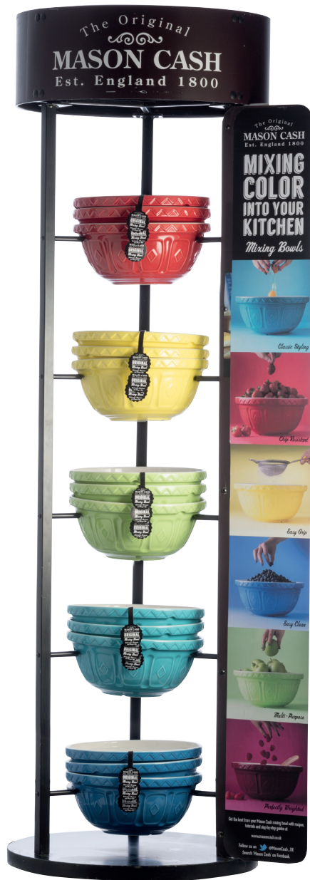
Color Mix Mixing Bowl Display Stand L21.6 x W21.6 x H73 inch 1402.421 / 1402.422 Pack Qty 1

Below are the Mason Cash merchandising units available to order: