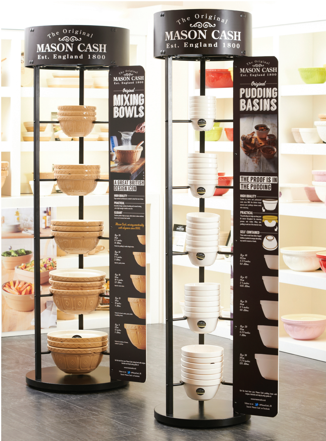
Cane Mixing Bowl Display Stand L21.6 x W21.6 x H73 inch 1402.406 / 1402.408 Pack Qty 1