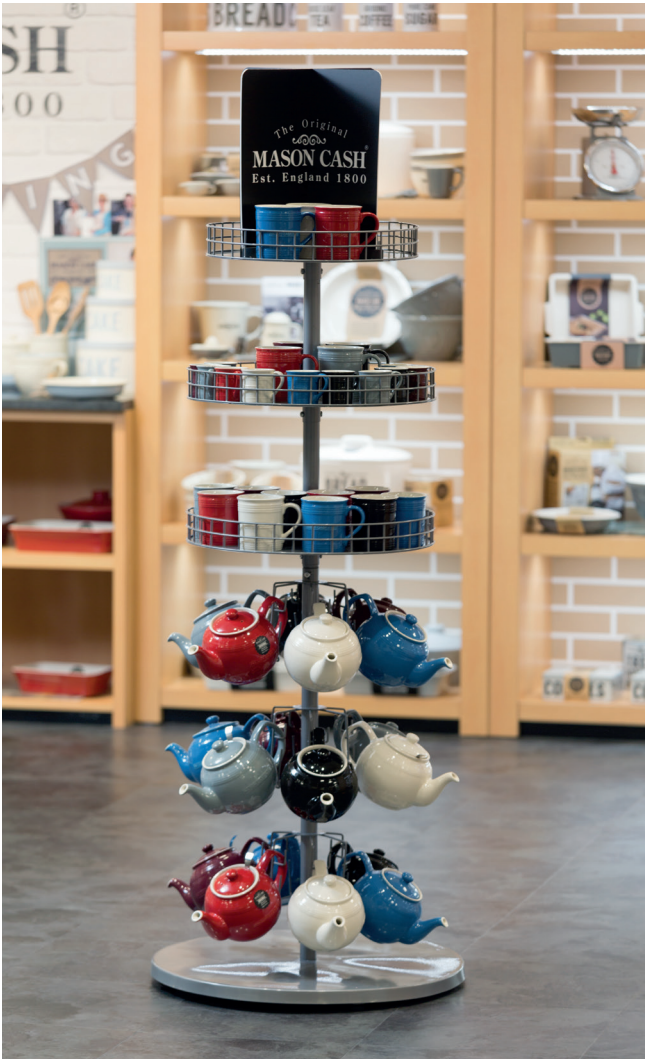
Mason Cash Merchandiser 1402.413U / 1402.414U

The Cane Mixing Bowl and In The Forest Bowl A5 size strut cards will help to tell the story of the iconic bowls visually, whether positioned alongside a product display or on a shelf. The Mason Cash shelf strips will help create a cohesive branded space that is easily identifiable from a distance.