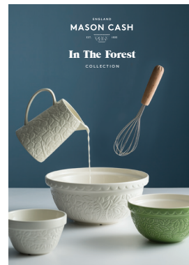
In The Forest Range A5 POS 6504.026