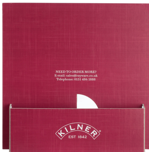
Kilner® Healthy Eating Guide Dispenser W11.65 x H11.65 inch (to fit Healthy Eating Guide) 6505.026