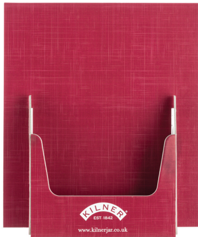
Kilner® A5 Mini Guide Dispenser W8.23 x H9.37 inch (to fit Canning Mini Guide) 6500.093

The Healthy Eating Guide provides a selection of our favorite recipes designed for the health conscious Kilner® consumer. The new Canning Mini Guide is an exciting sales aid; packed with canning tutorials, recipes and tips, there's something for any homemaker whether a beginner or at a more experienced level.