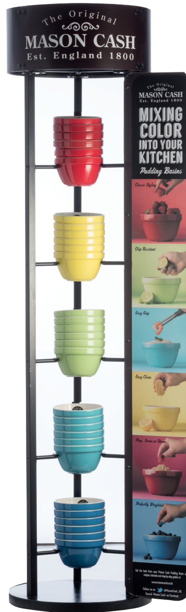
Color Mix All-Purpose Bowl Display Stand L15.7 x W15.7 x H73 inch 1402.423 / 1402.424 Pack Qty 1

Order both items together (1402.422 + 1402.421) for a complete stand.