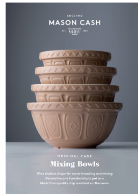
Mixing Bowl A5 POS 6504.003

The Mason Cash Merchandiser (1402.413U / 1402.414U) is available to all customers free of charge on orders over $500 and can fit 18 teapots, along with an assortment of mugs and espresso cups.